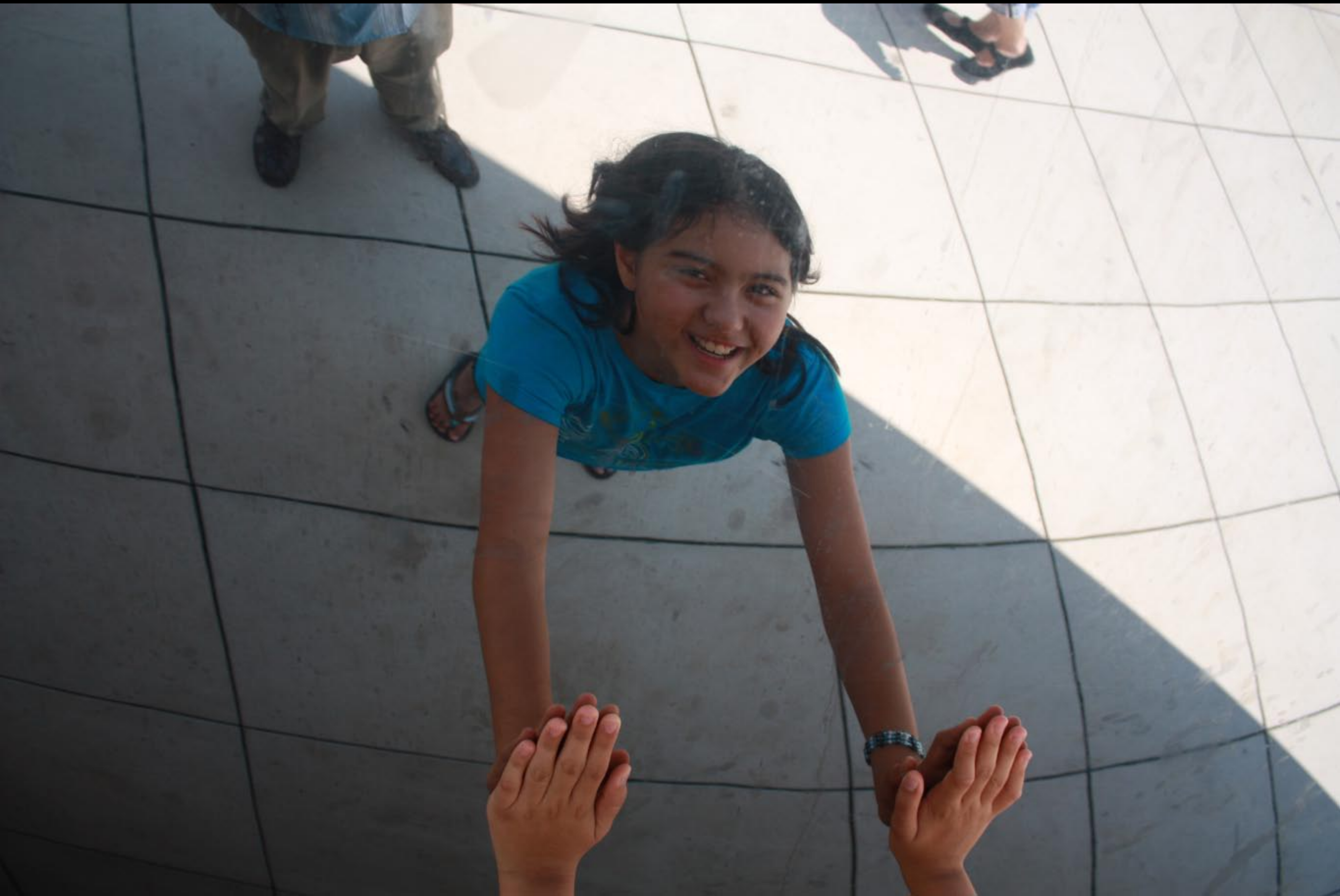
touching the bean