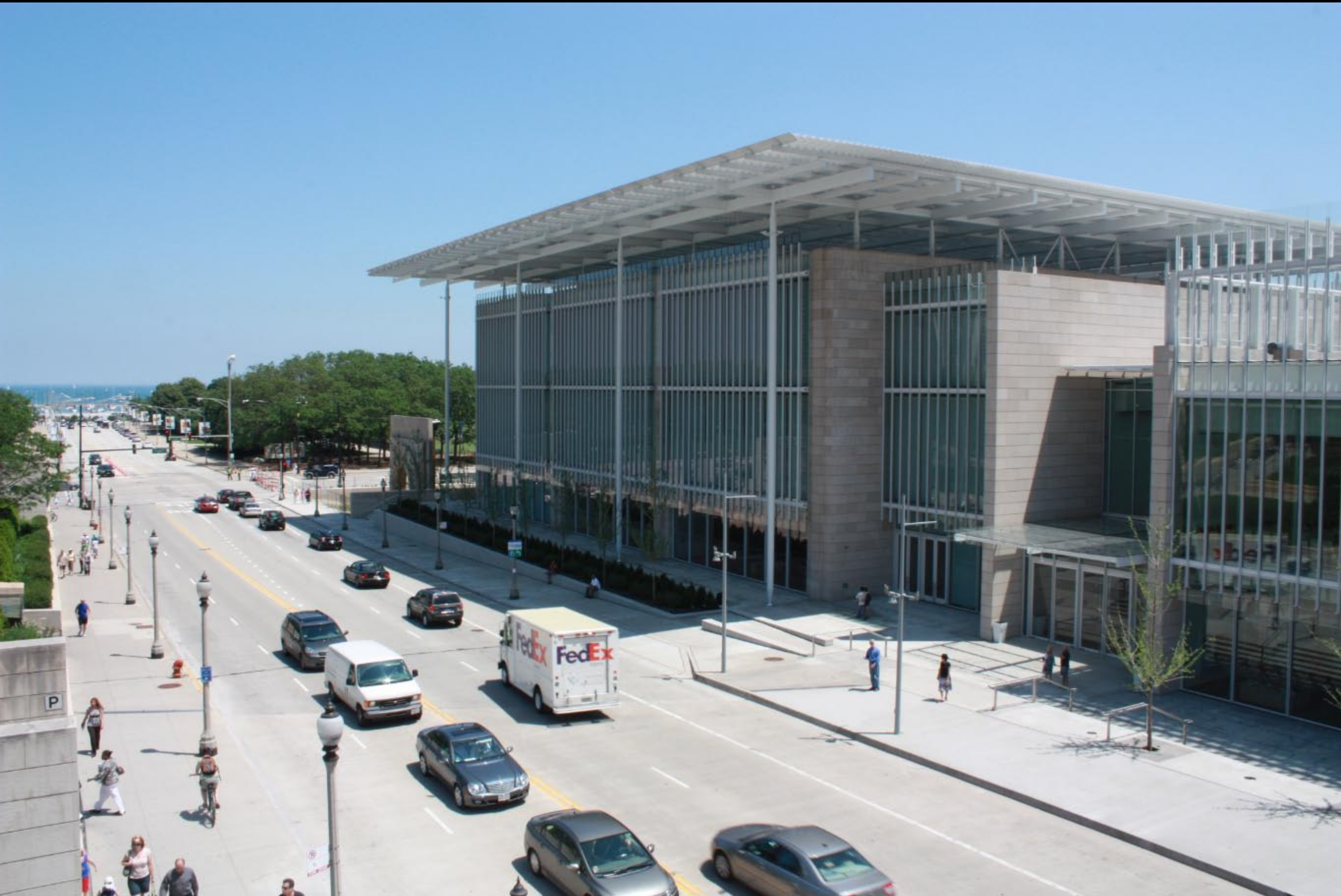
Art Institute of Chicago