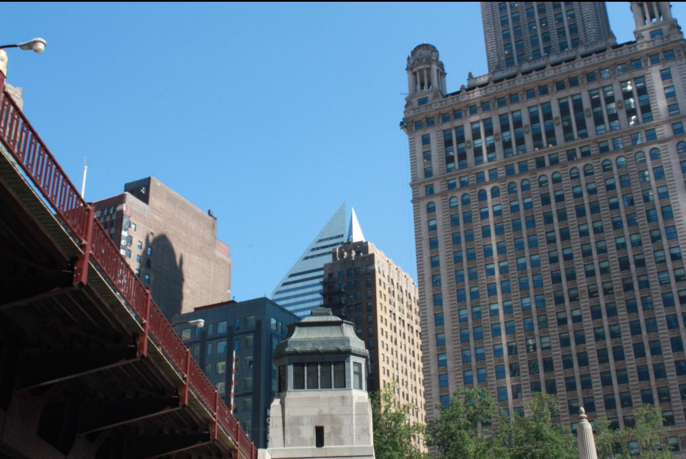
Stone building peeking through