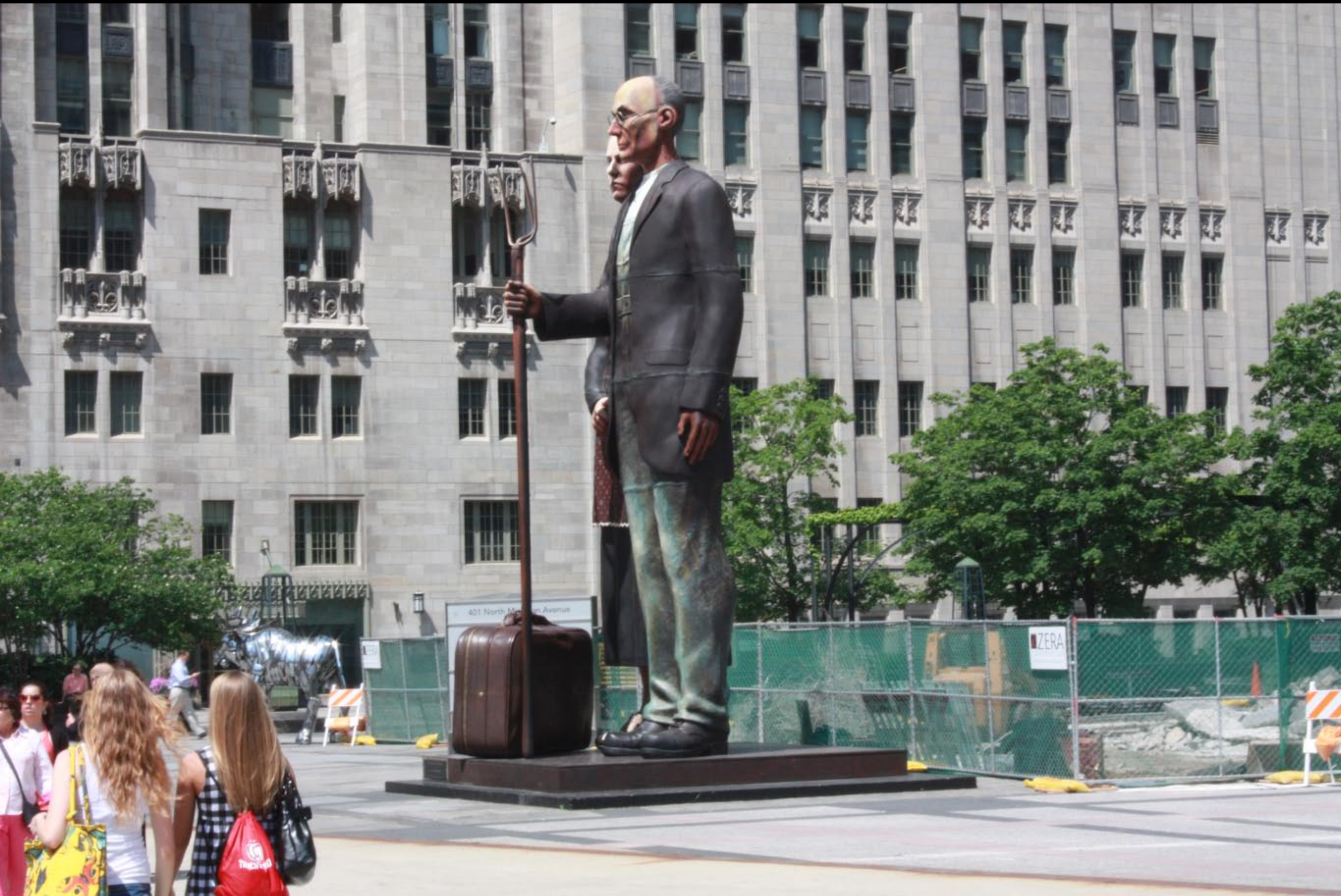
Chicago - Larger than life American Gothic