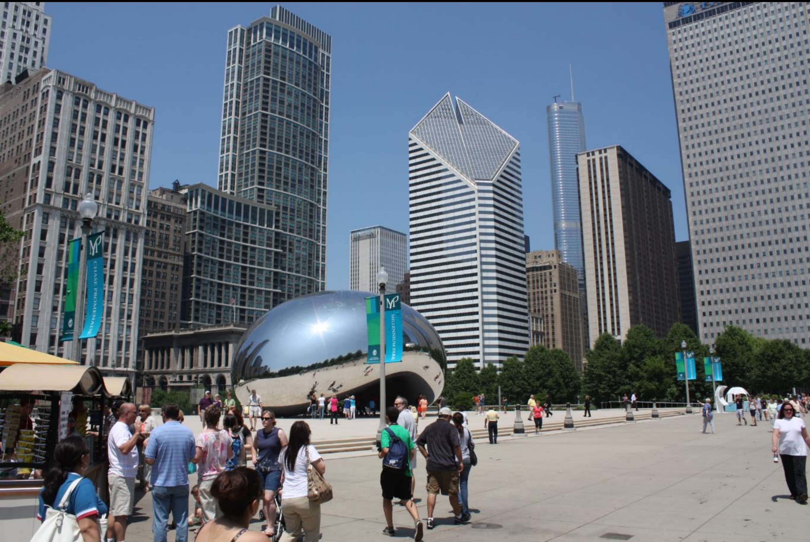
Millenium Park - Silver Bean, Stone Building