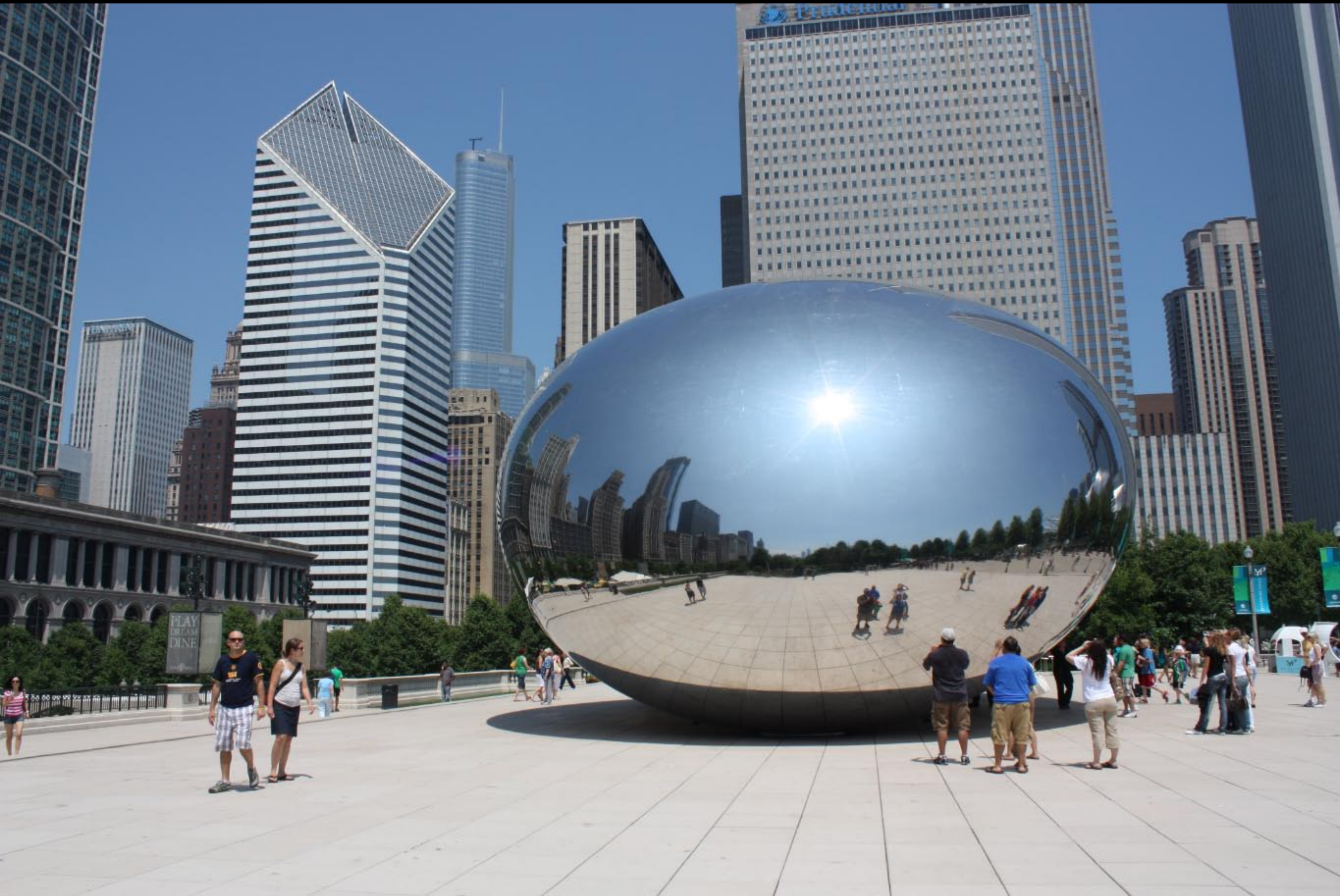
Bean again, from the south side