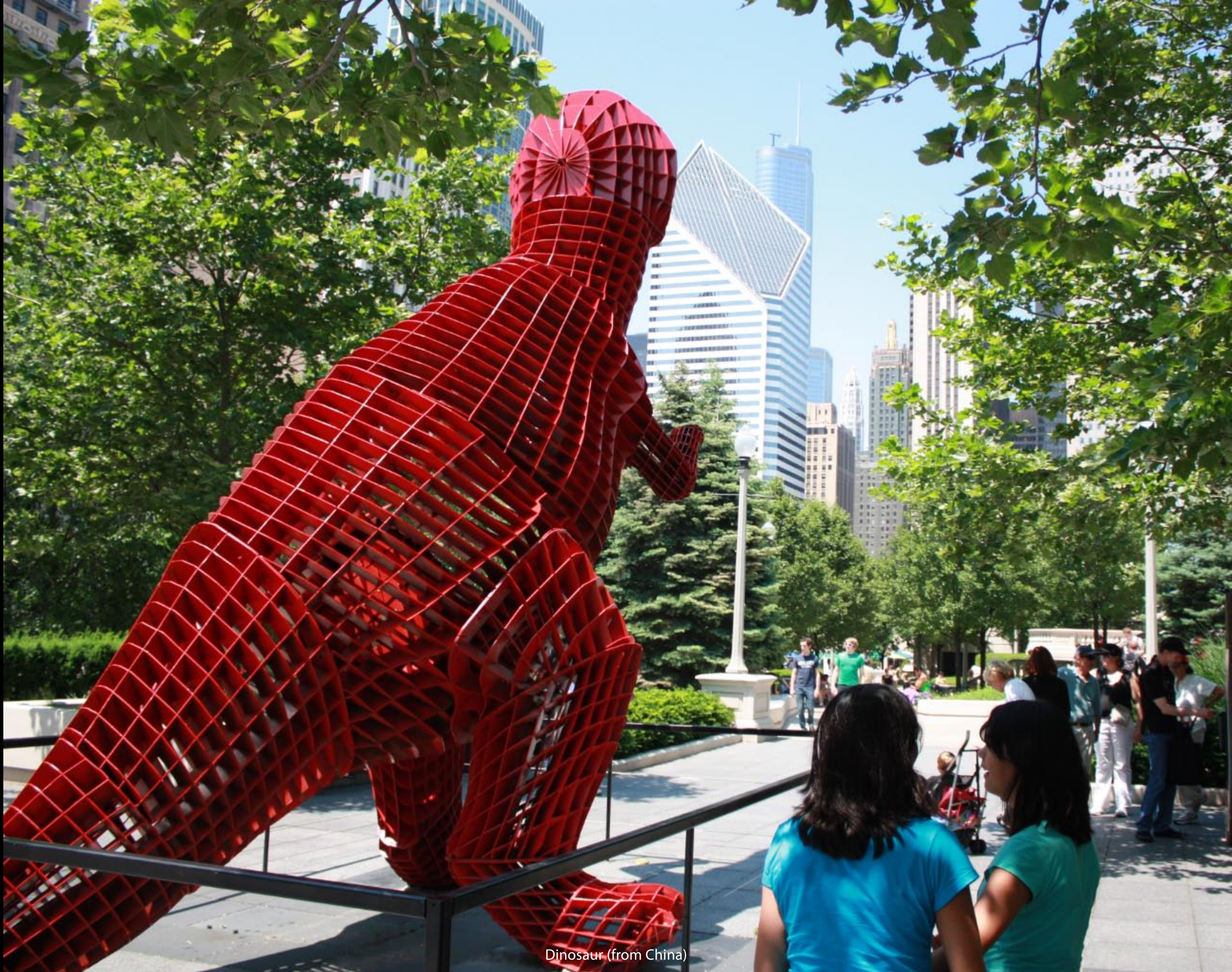
Dinosaur (from China)