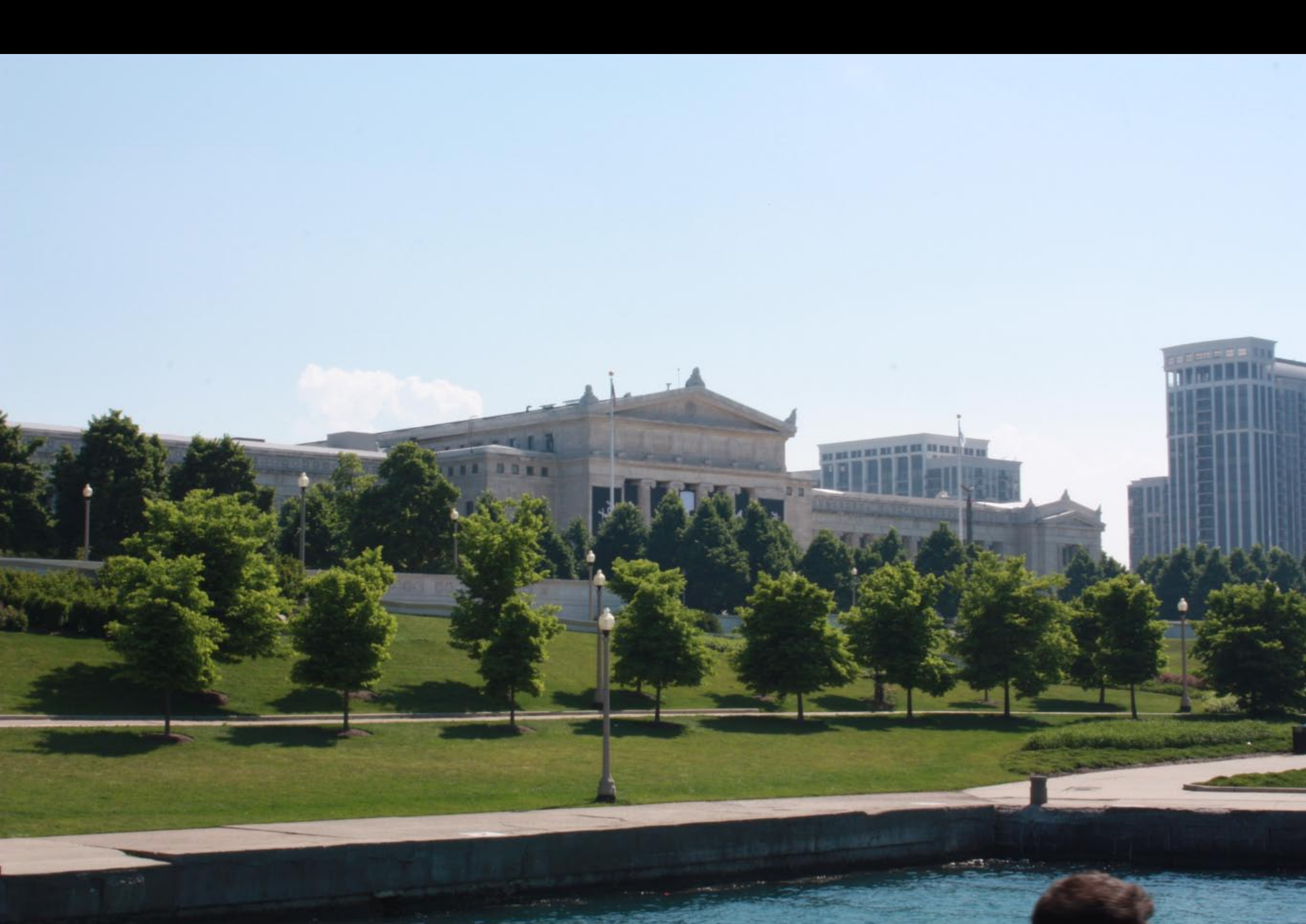
Field Museum of Chicago