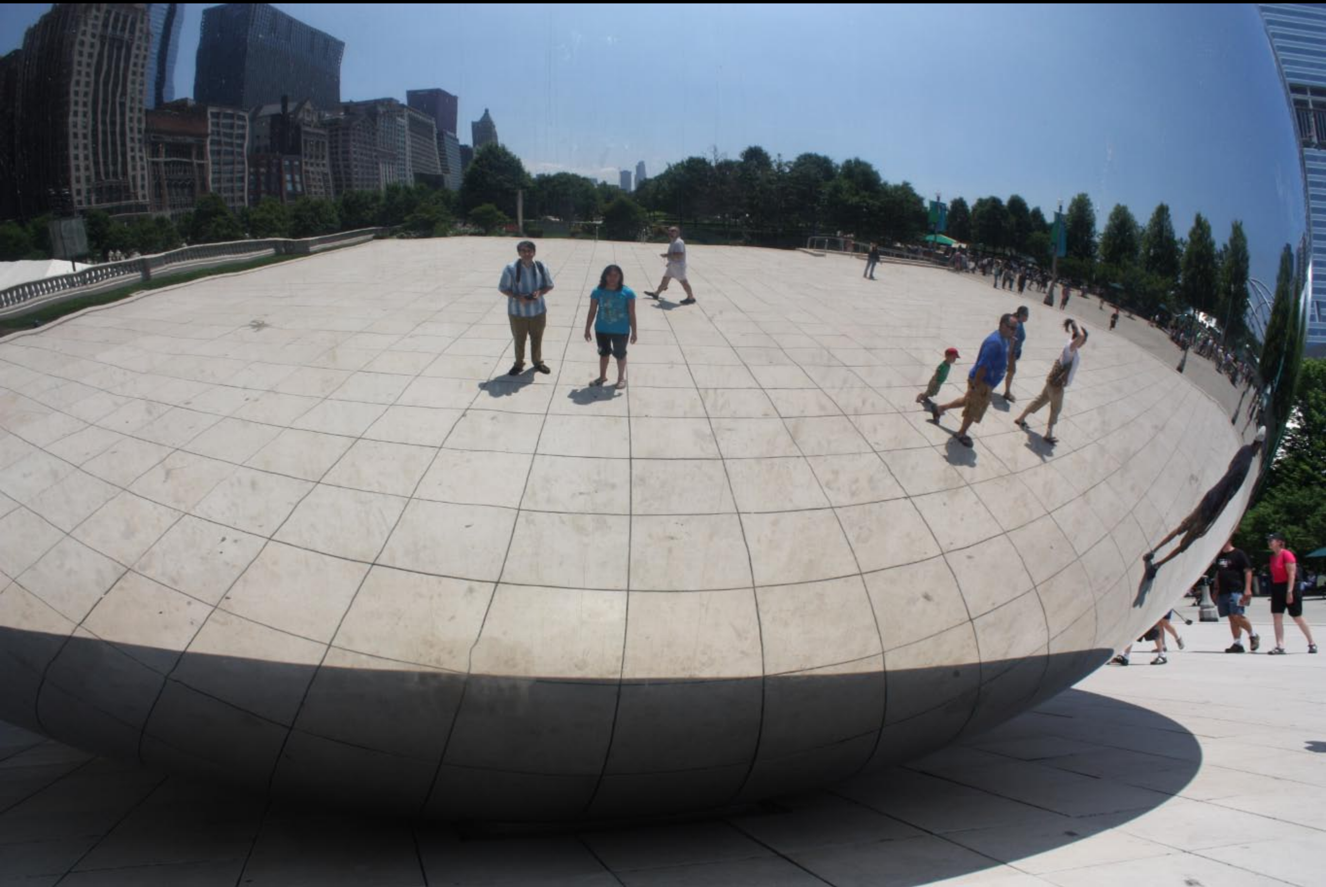
Near the bean