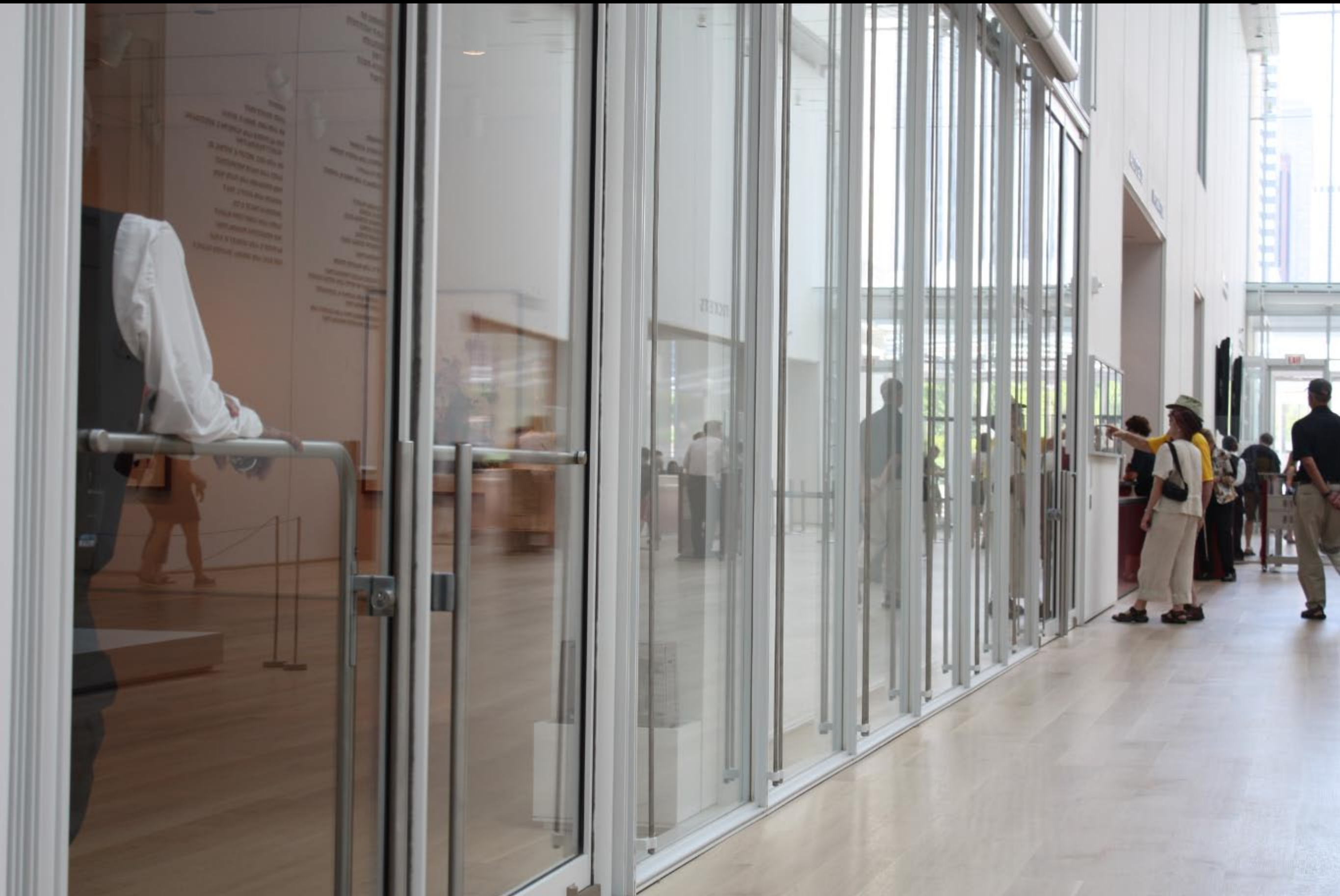
Shoulder and reflection