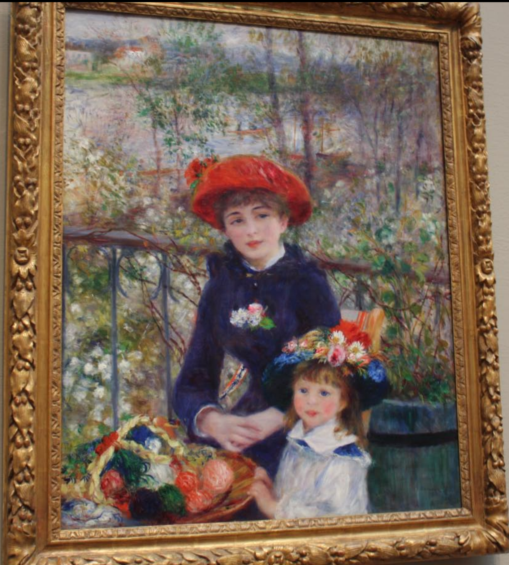
Pierre-Auguste Renoir French, 1841-1892 Two Sisters of the Artist, 1881 Oil on canvas Pierre-Auguste Renoir painted this delightful Impressionist scene in his garden, with his sister, the artist's daughter, and his wife, in the foreground. The painting was made in 1881, when Renoir was in his late 40s. It is a beautiful example of his Impressionist style, with its soft, visible brushstrokes and focus on light and color. The painting is now in the collection of the Art Institute of Chicago.