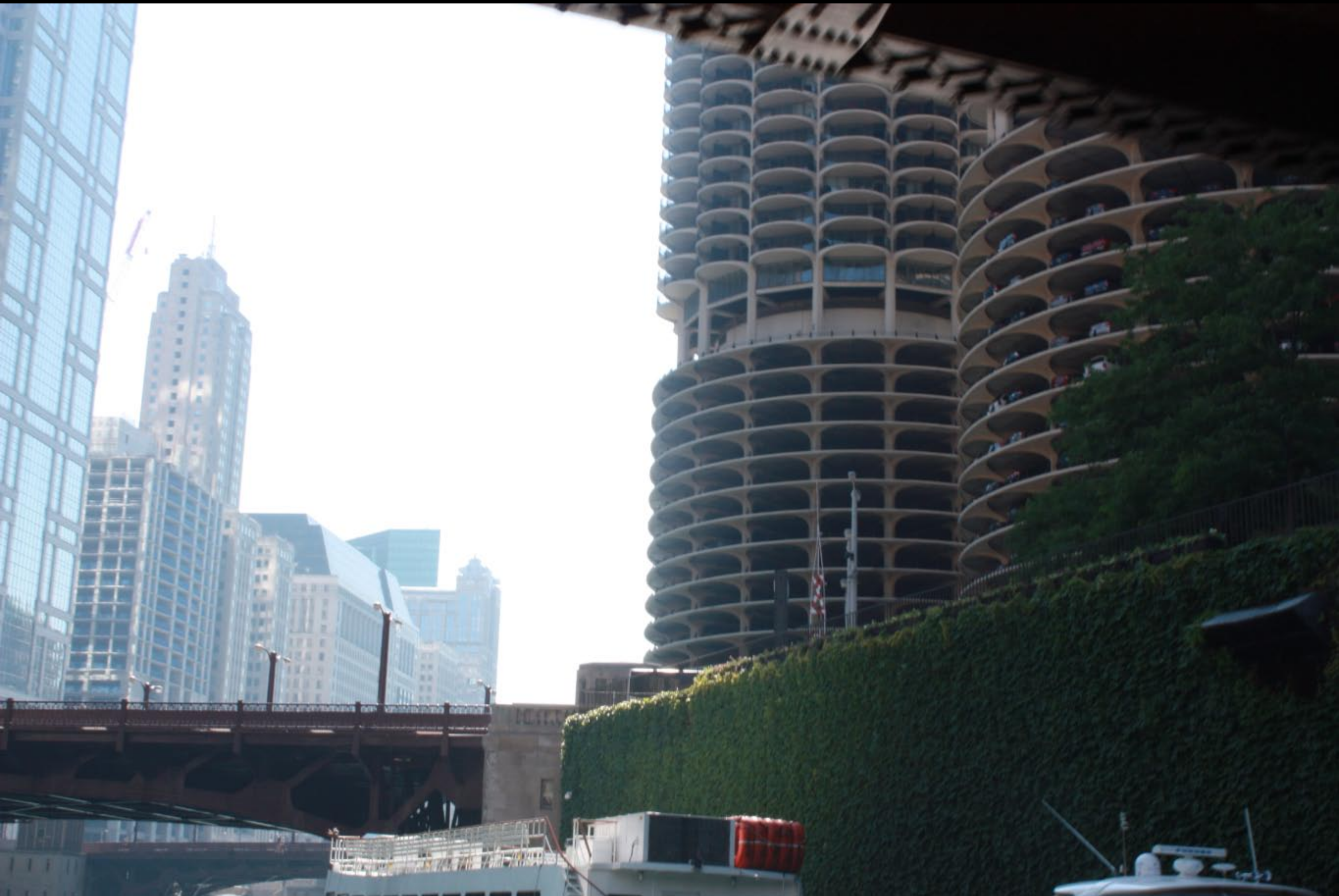
Marina City twin round towers