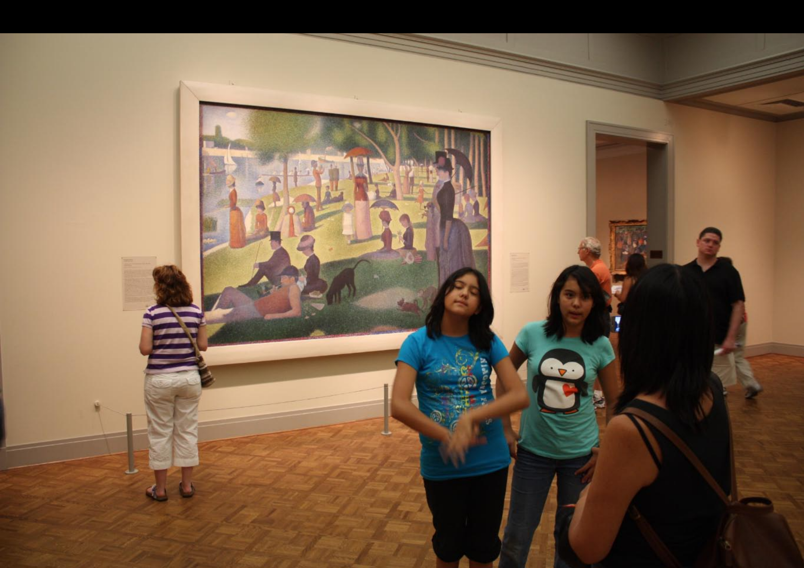
Sunday in the Park with George