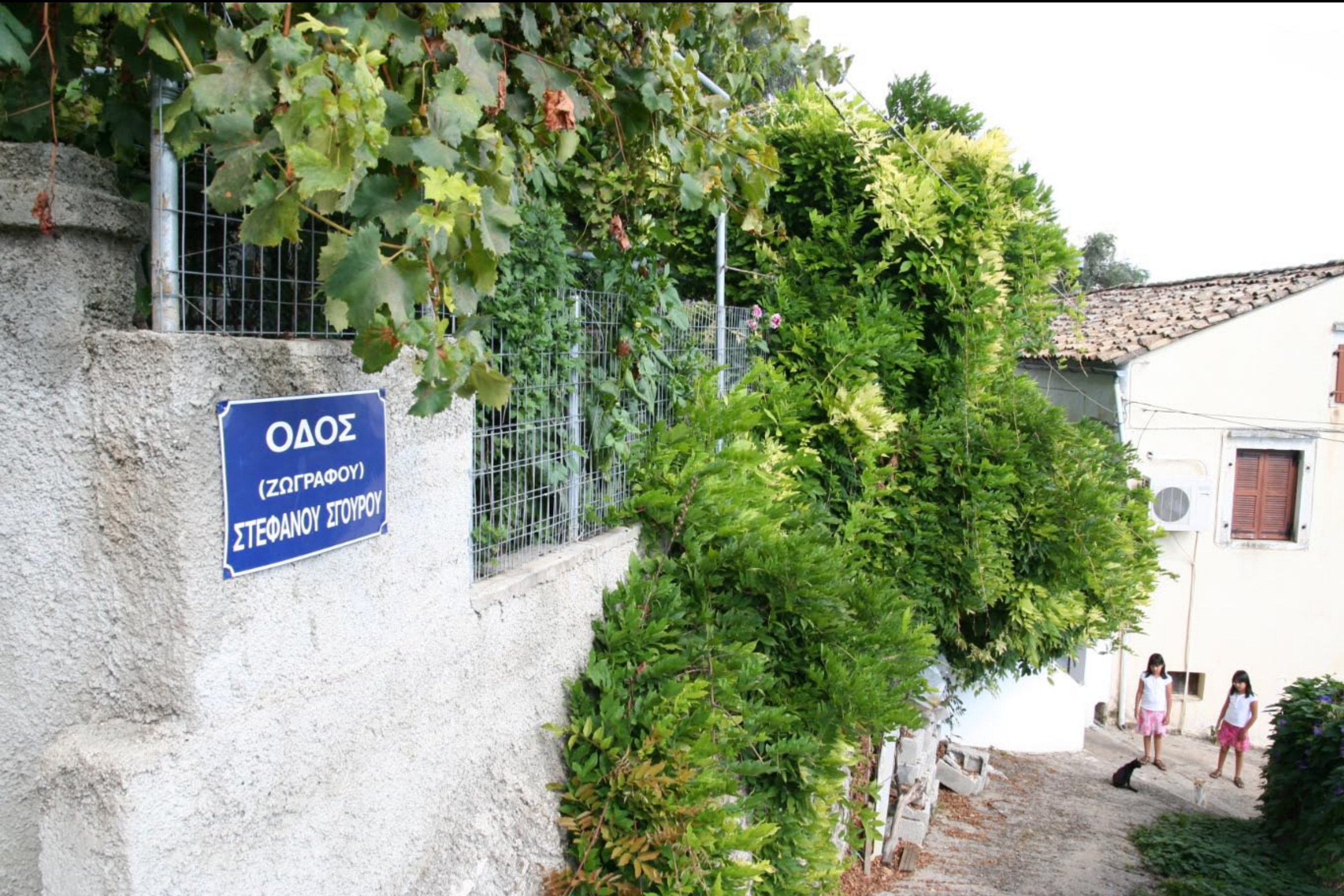
Stefanos Sgouros (artist) Street (OY ending means belonging to)