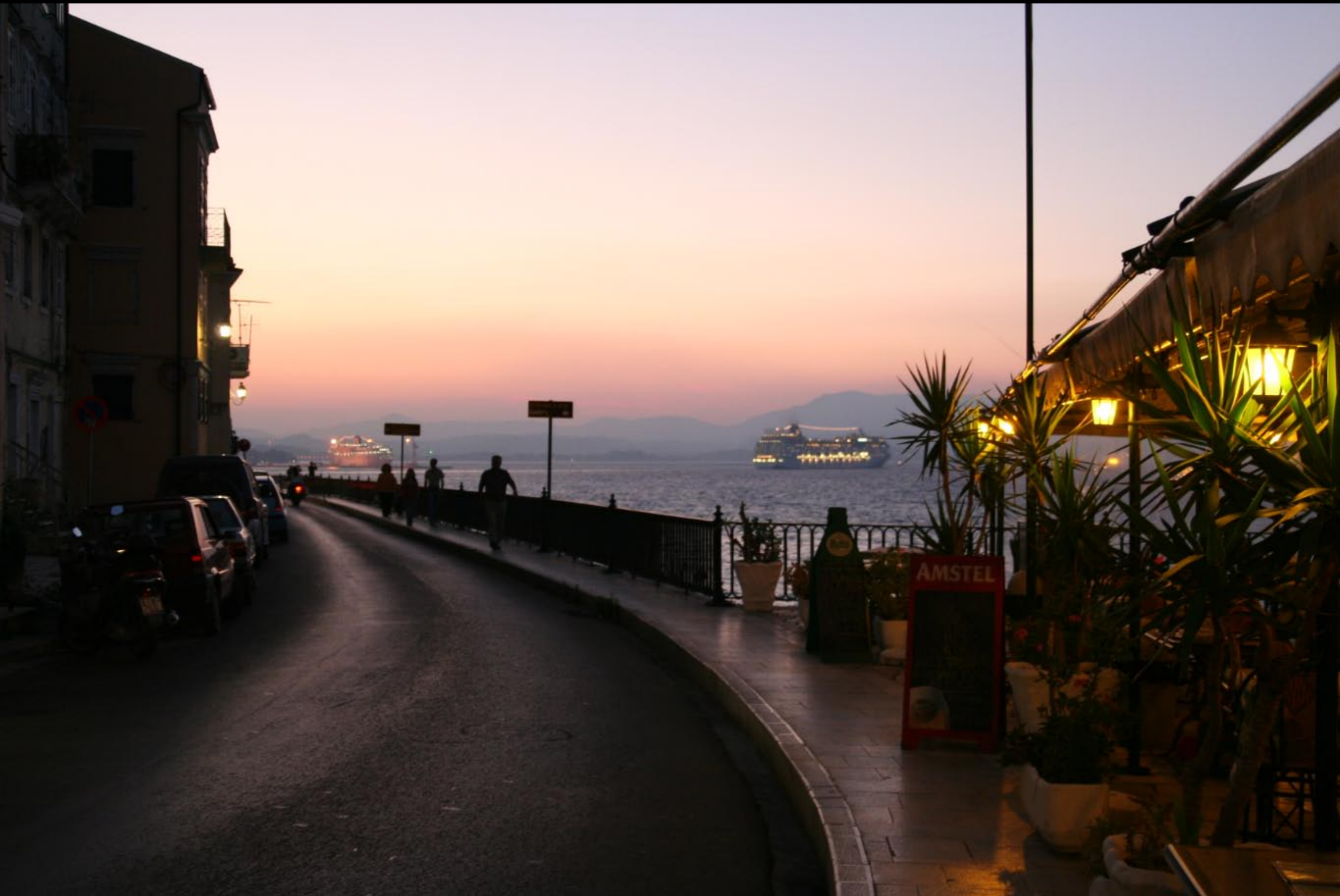
Later that night