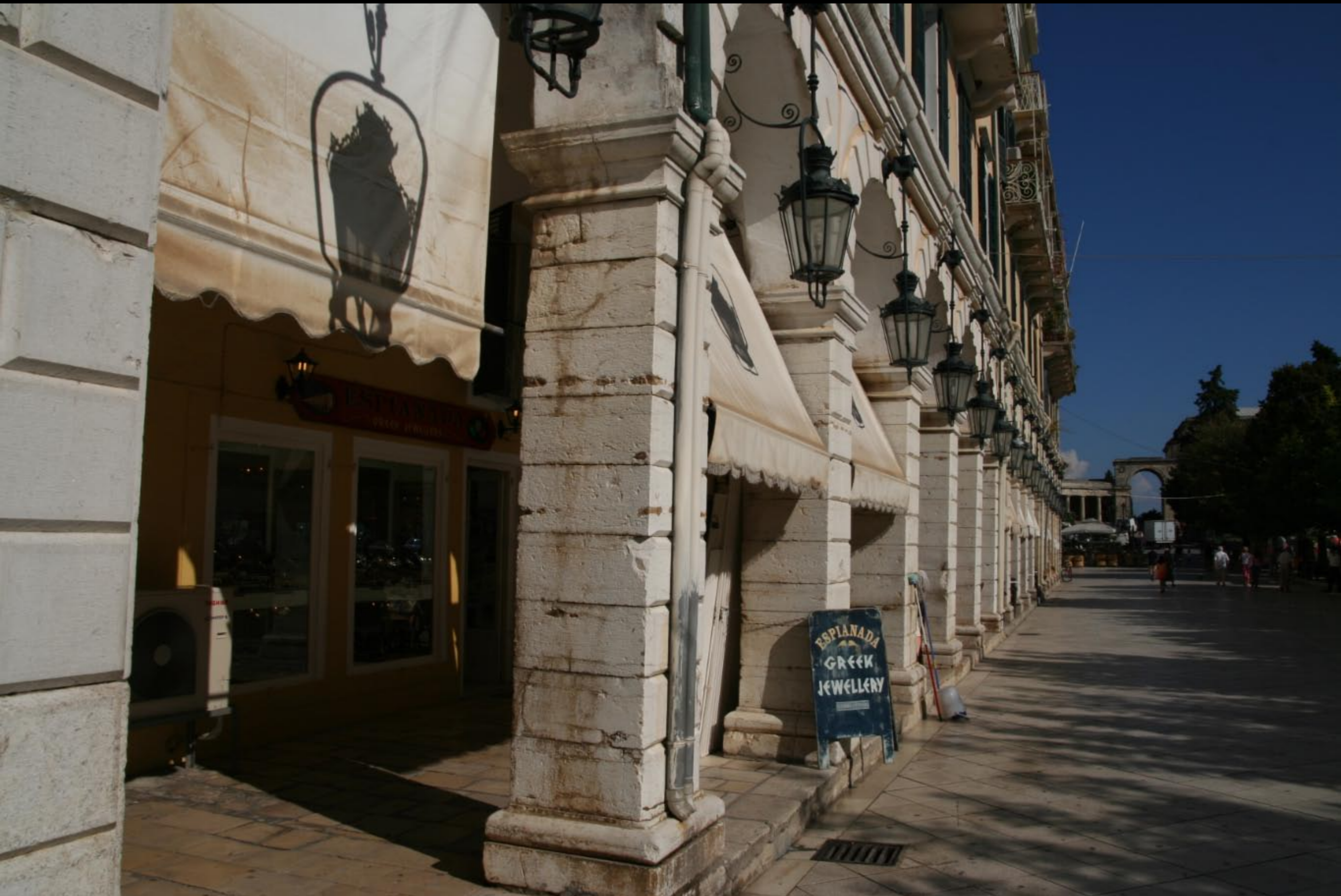
Street and Lanterns