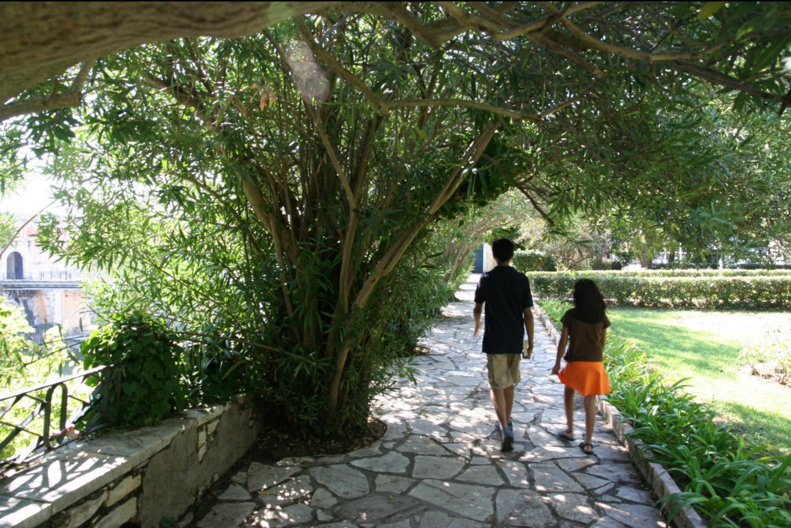
On way to Old Fort