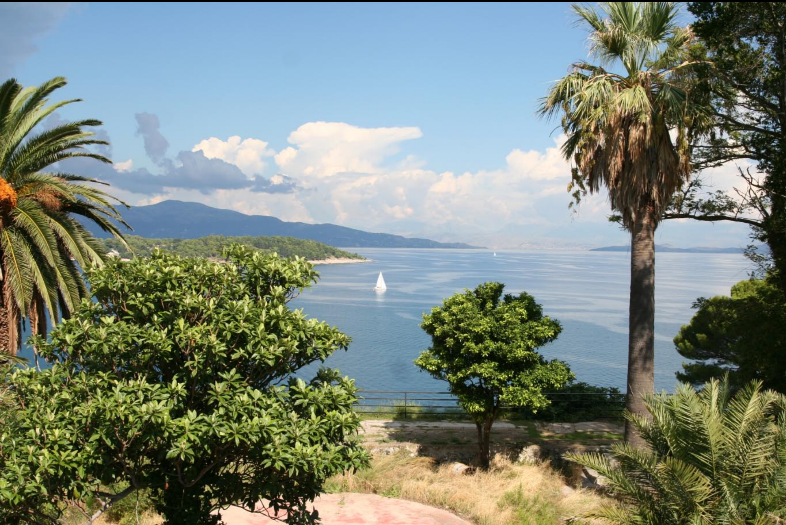
Views from the Fort