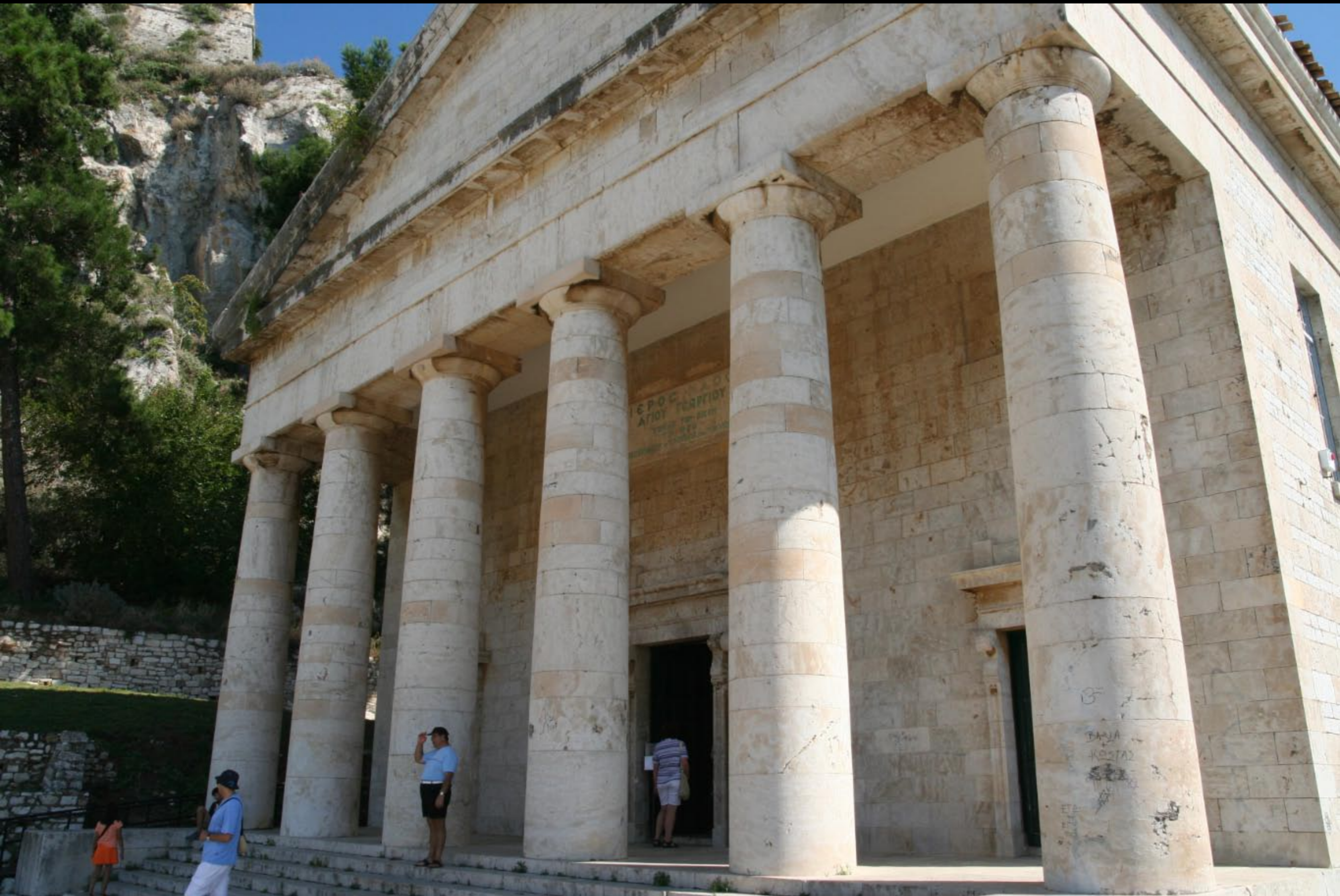
St. George Church