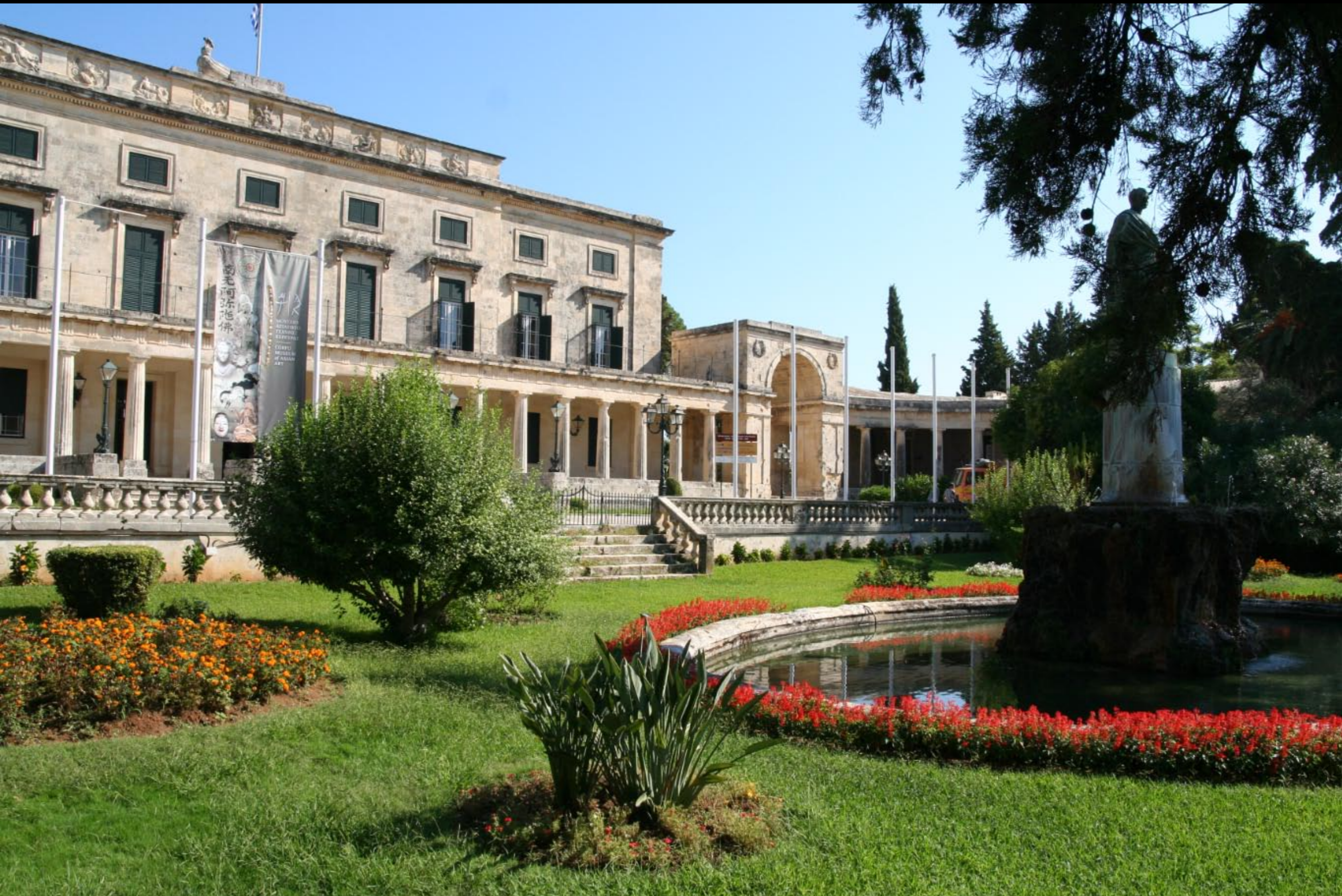
Corfu, Asian Arts Museum