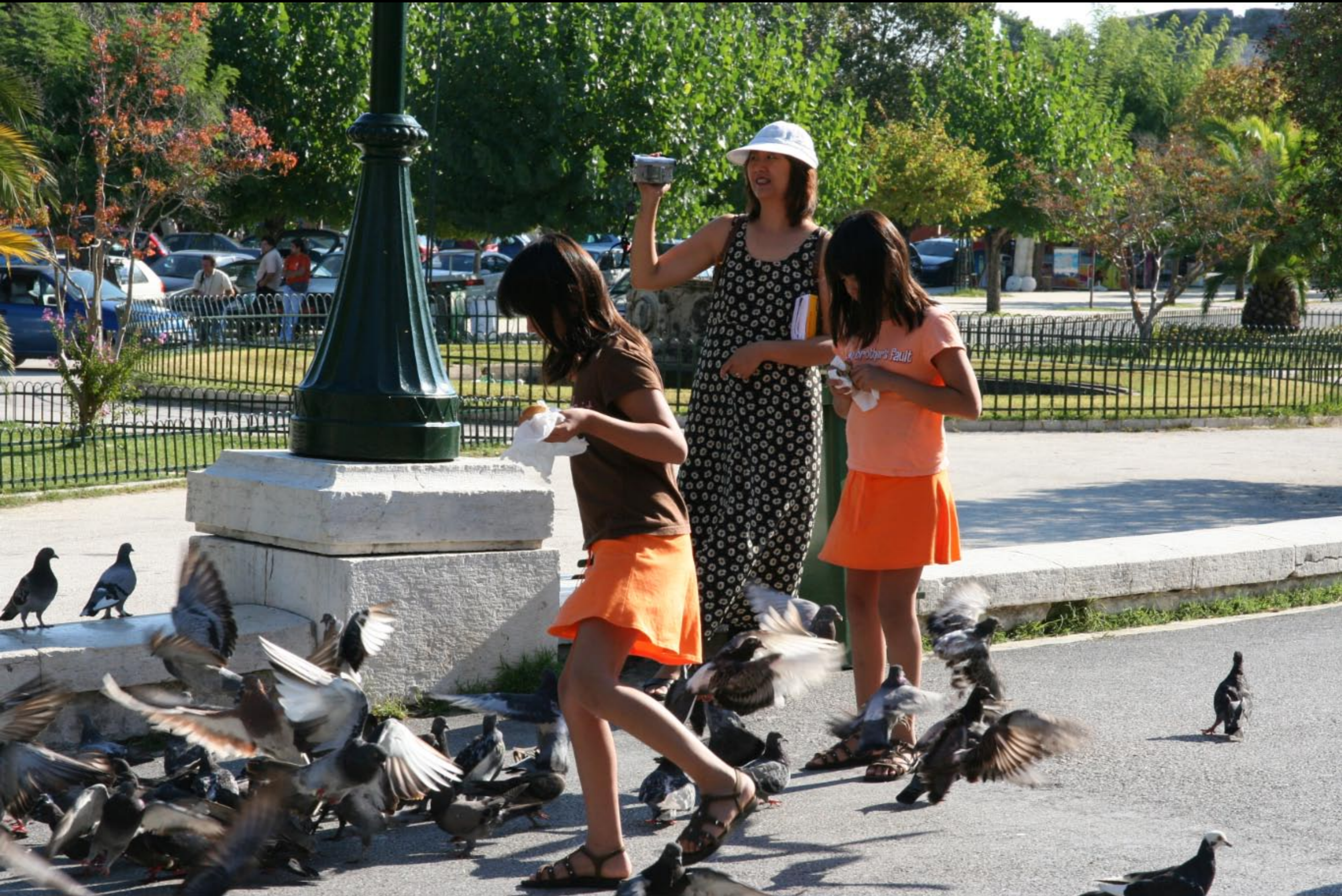
Pigeon feeding, video taking