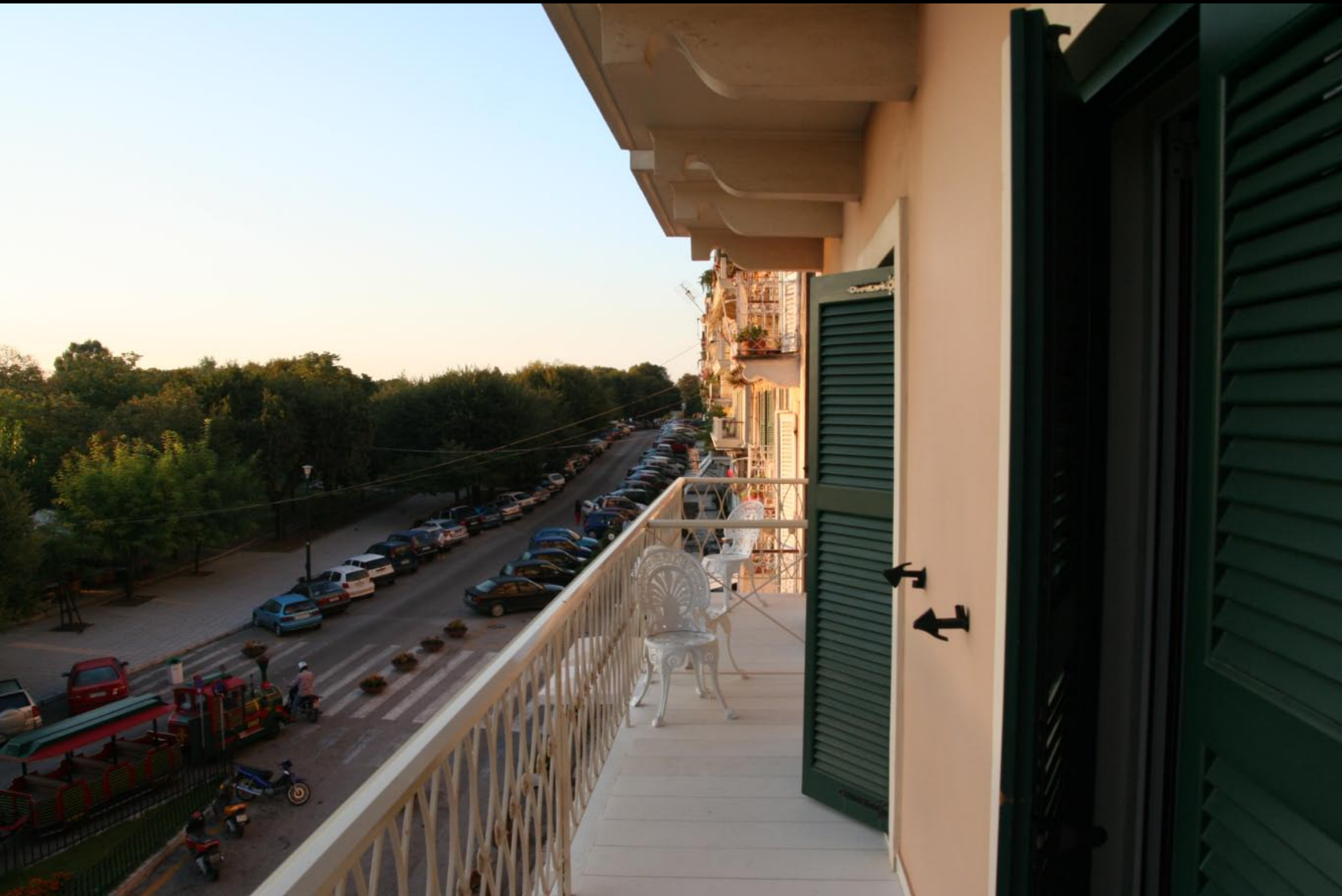
View from kids room balcony