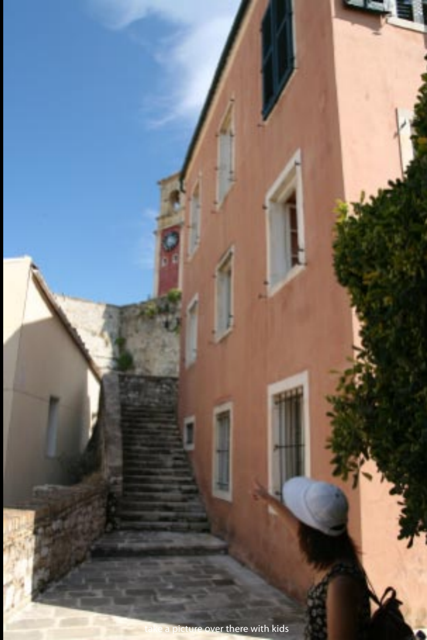
take a picture over there with kids