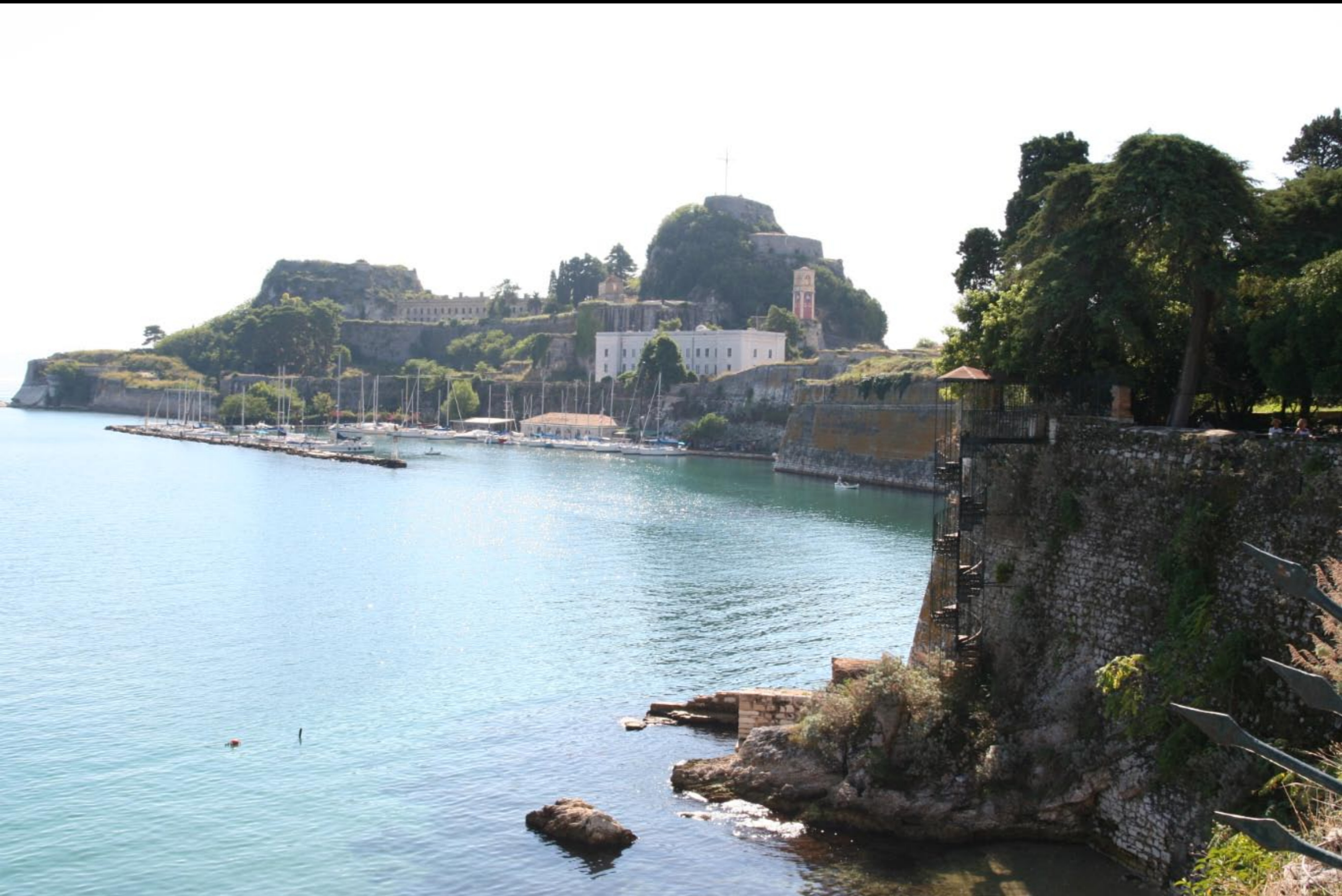
Yet another view