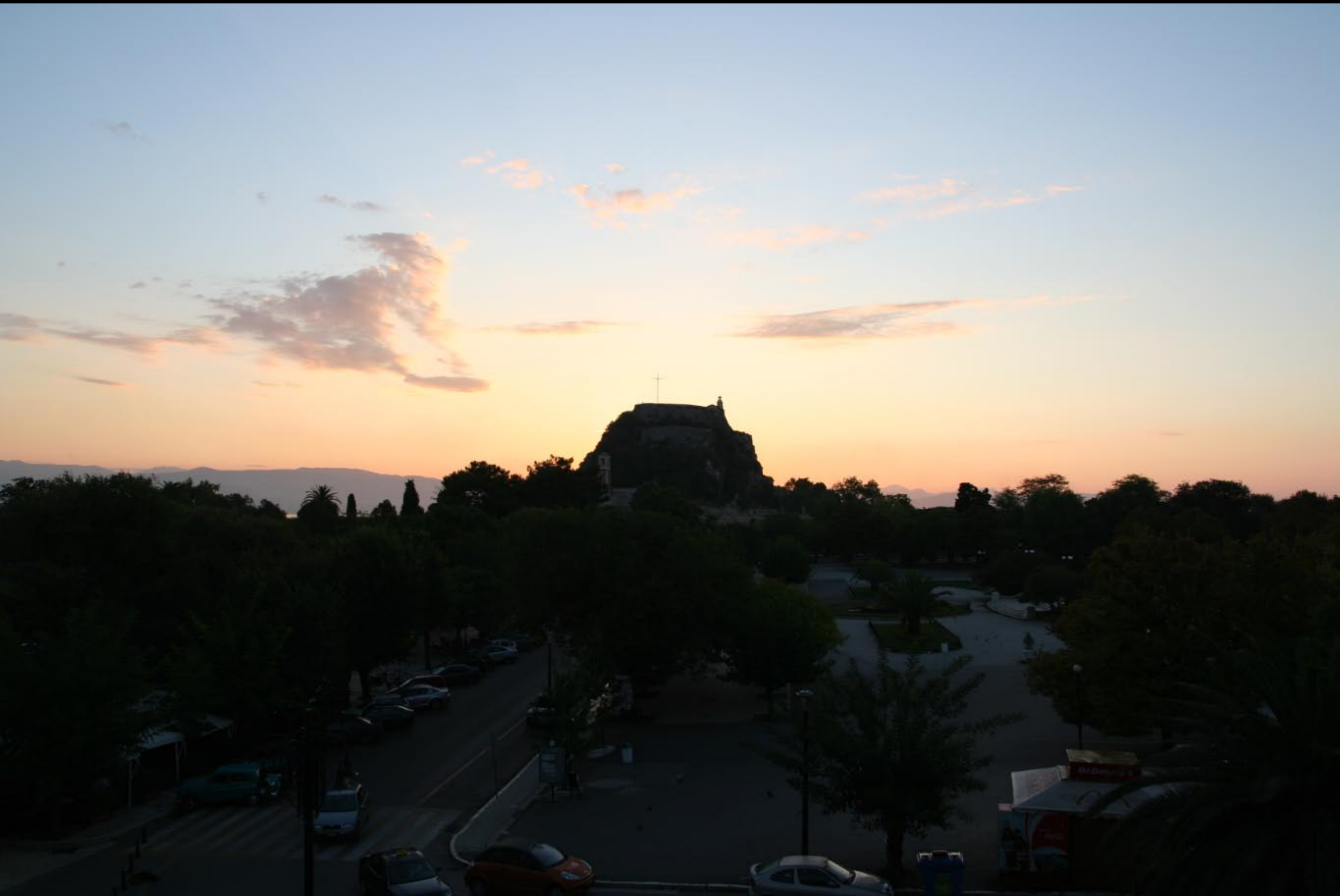
Hotel room view