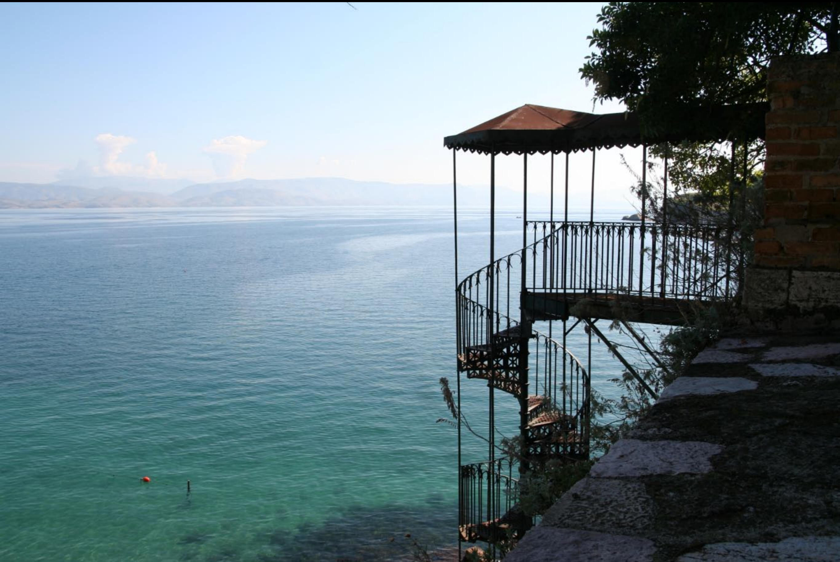
spiral staircase to the sea