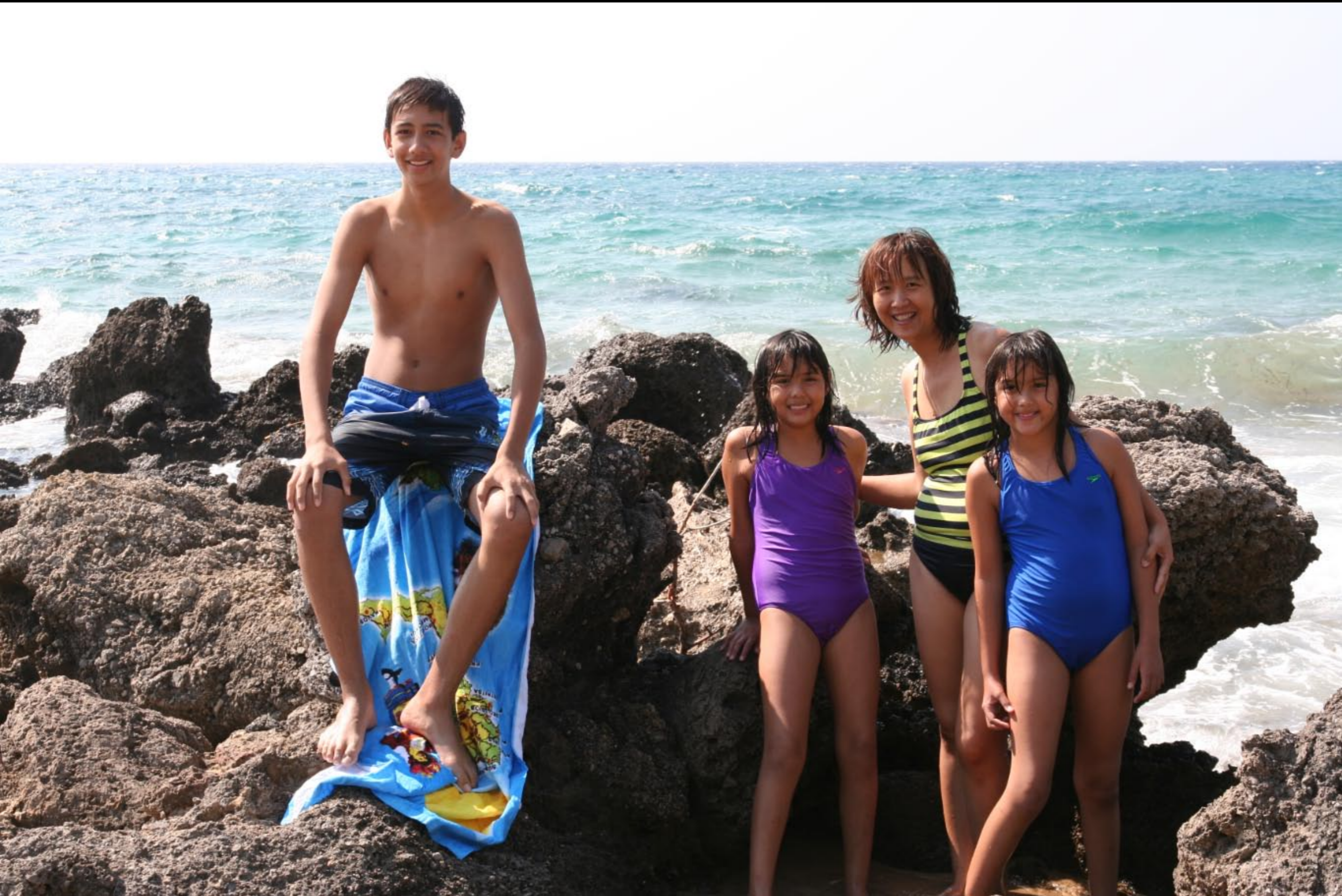
All smiles after a day of fun in the water