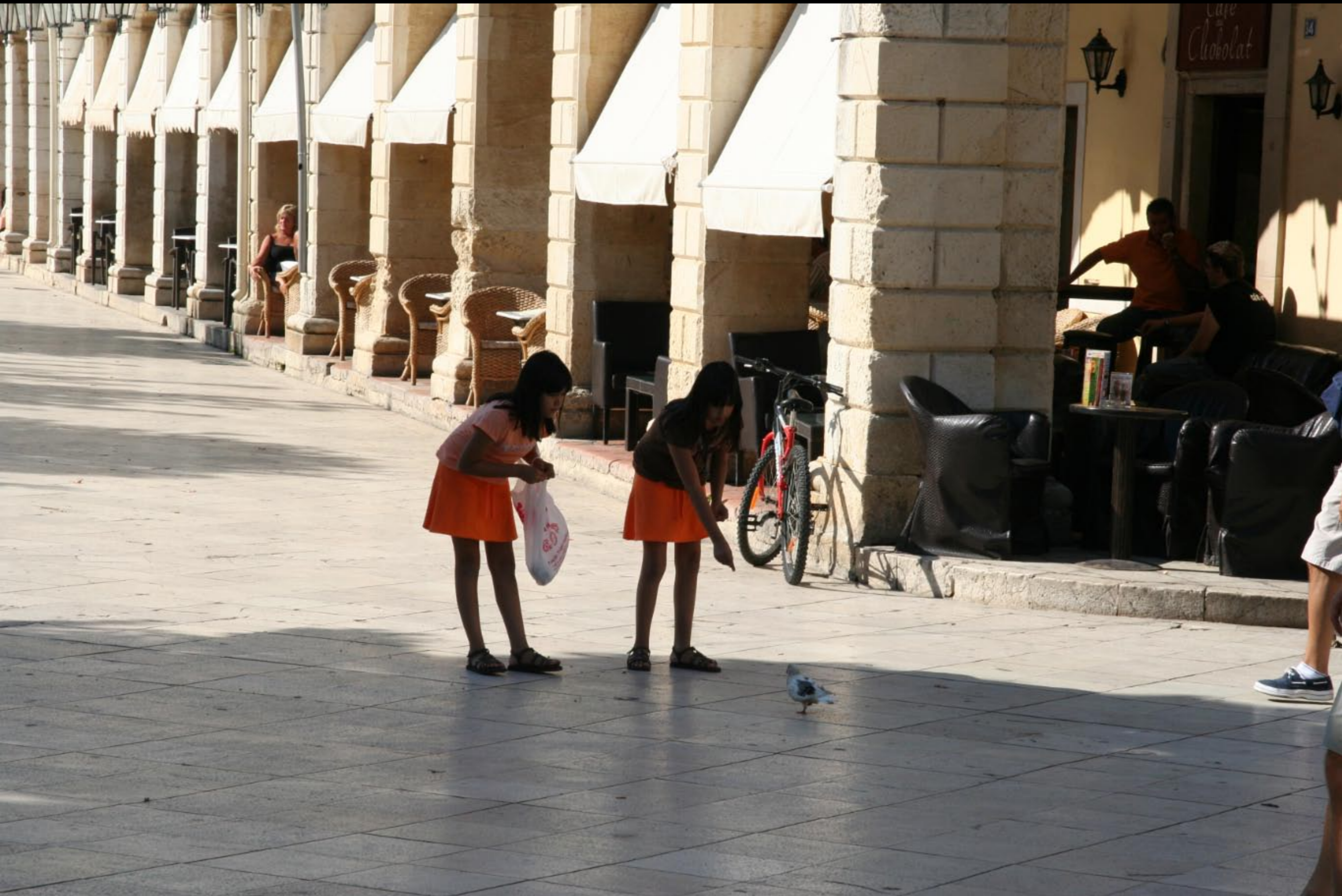
more pigeon feeding