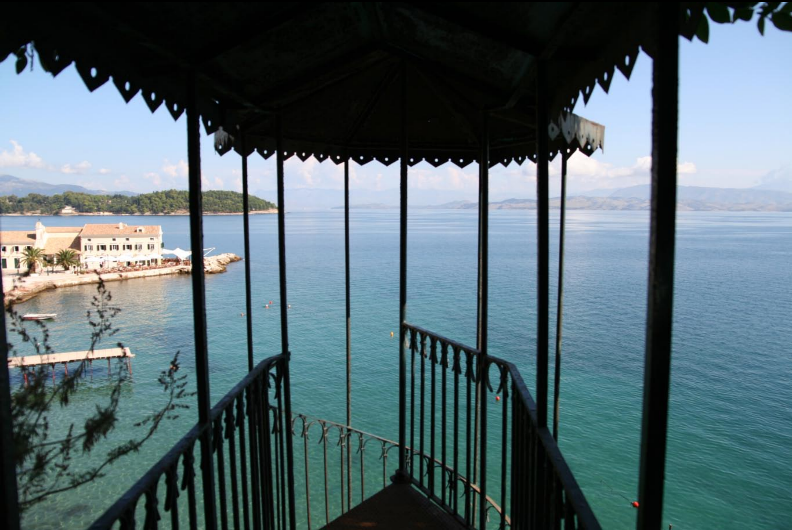
Down the staircase