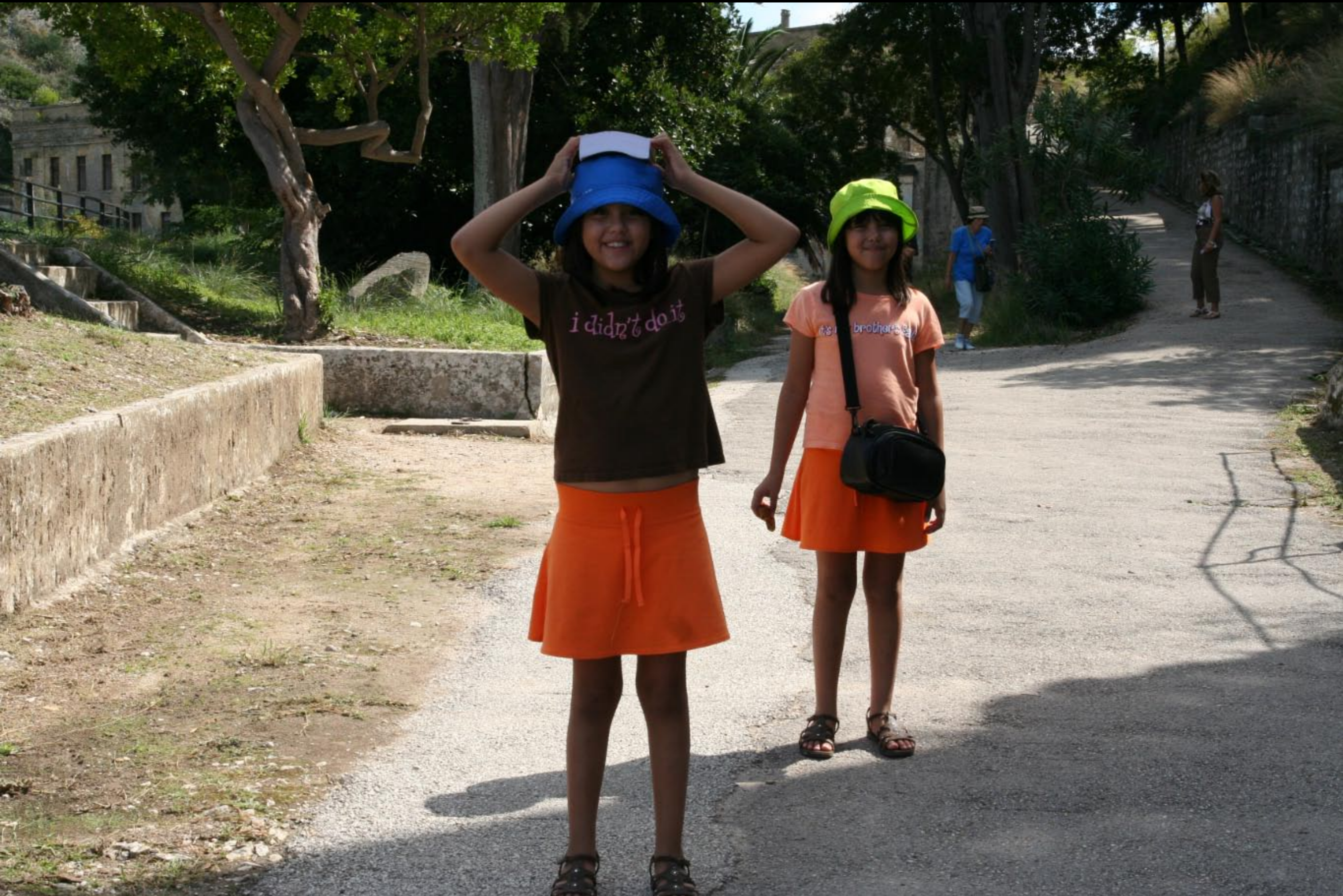
coming down from the top