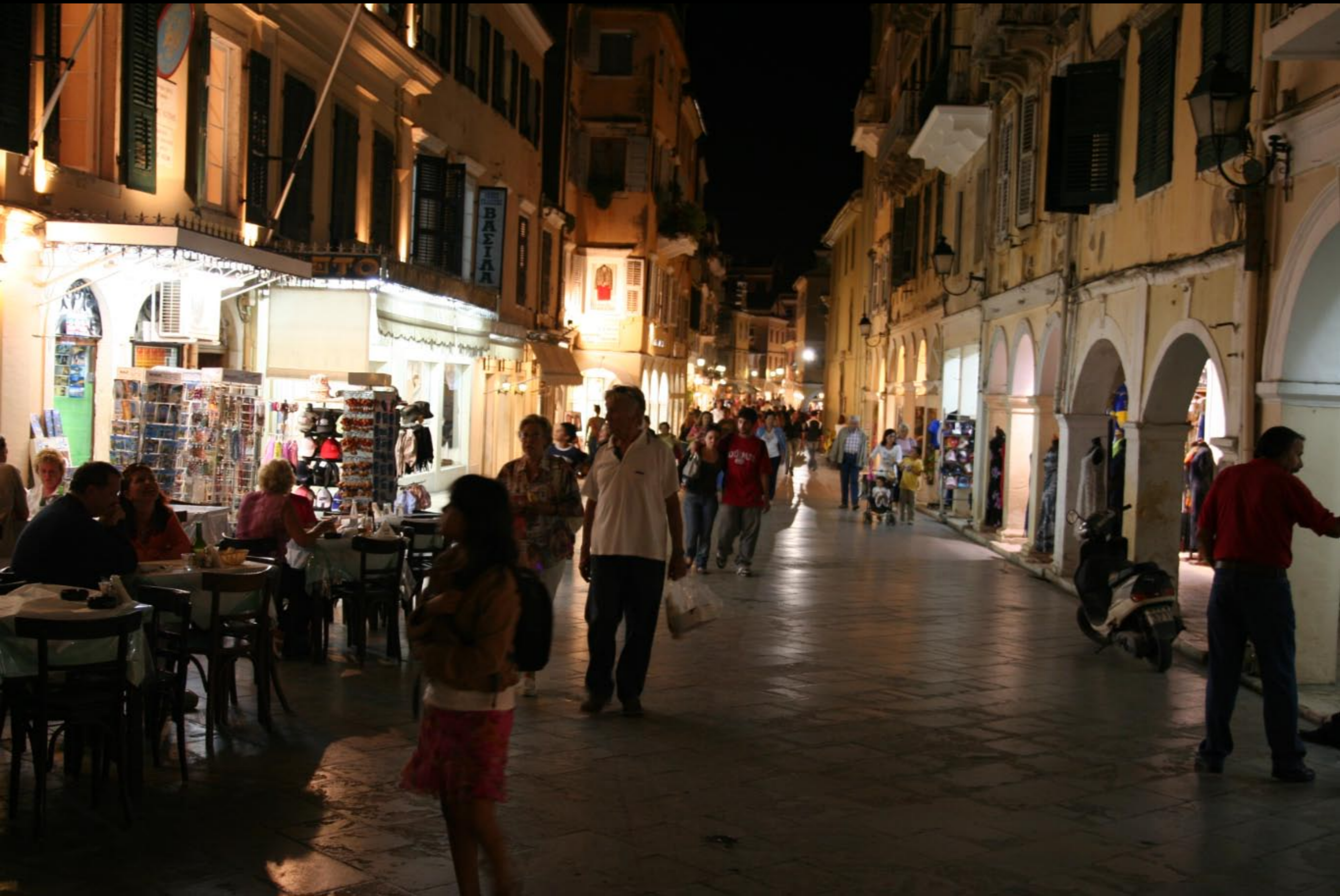
More night scenes