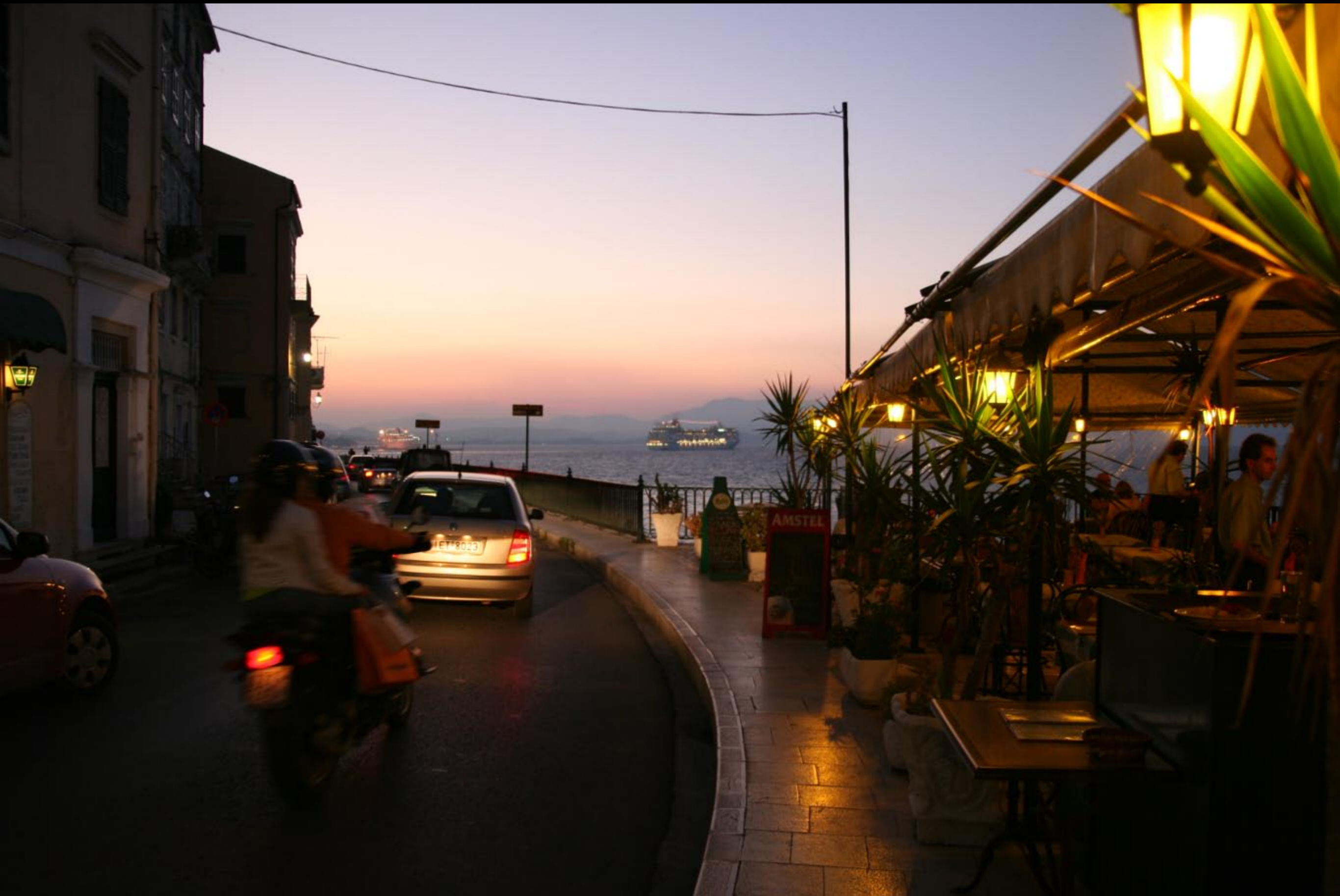
Corfu town, dining area to the right