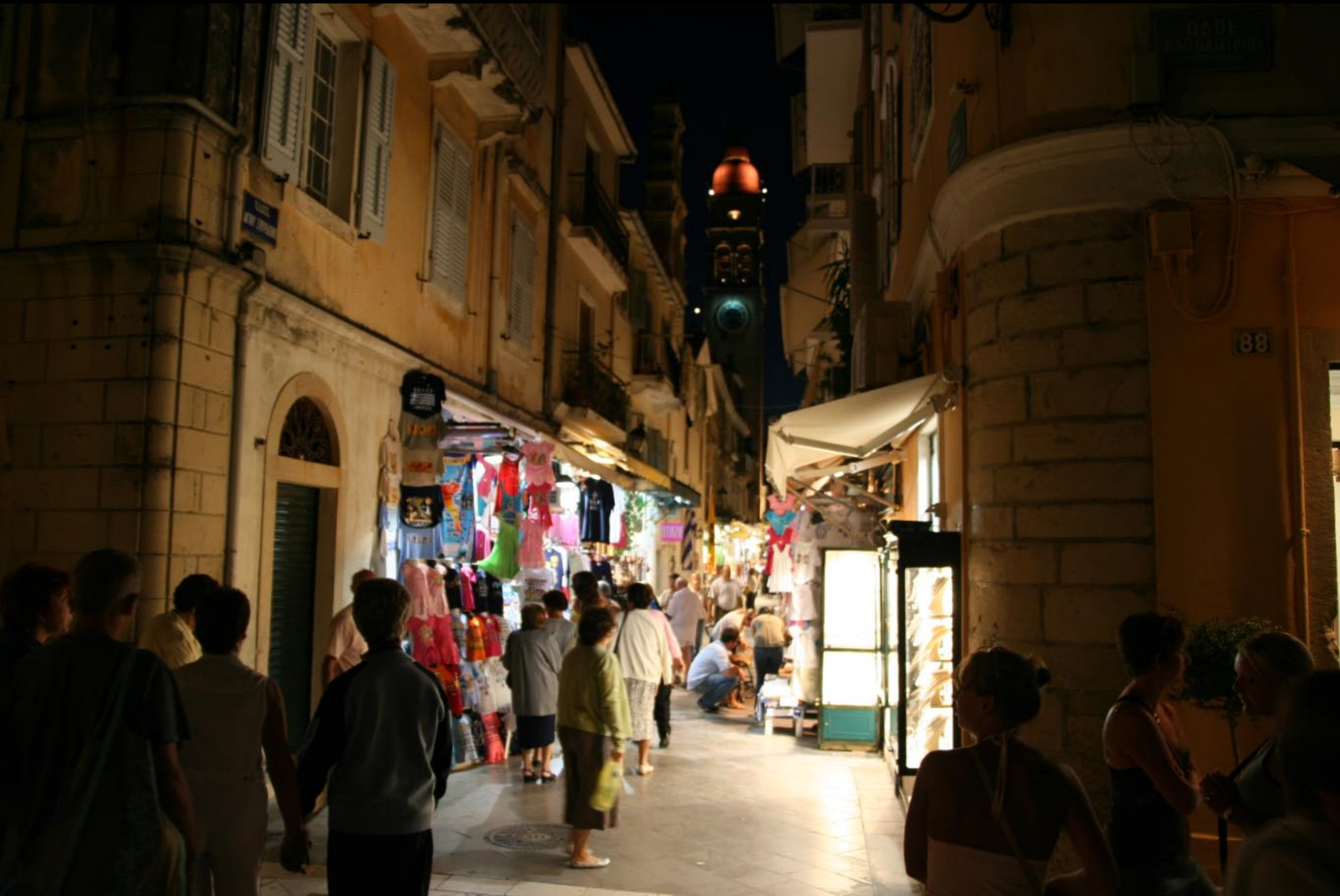
Corfu town street at night, St. Spyridon bell tower lit up