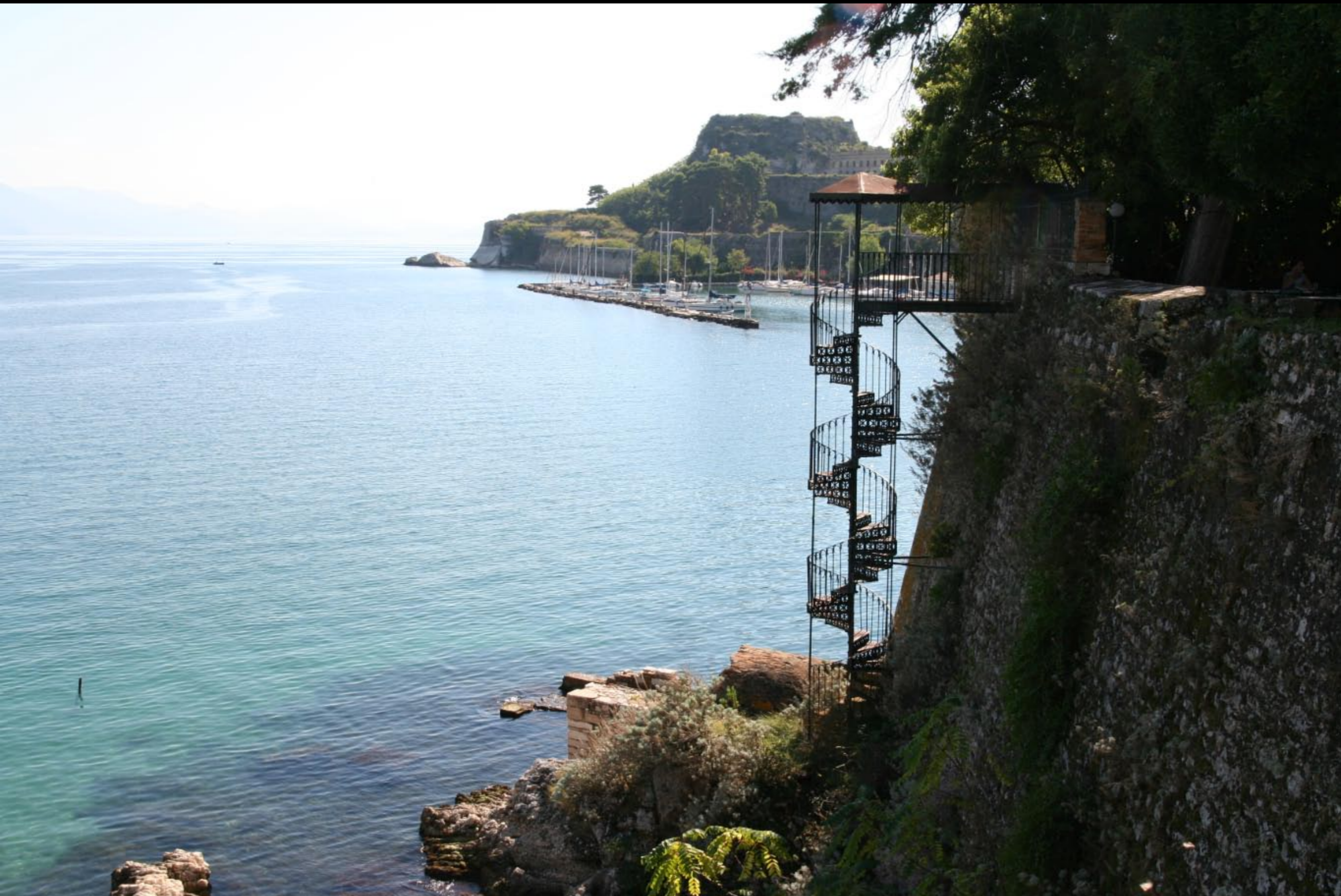
More spiral staircase views