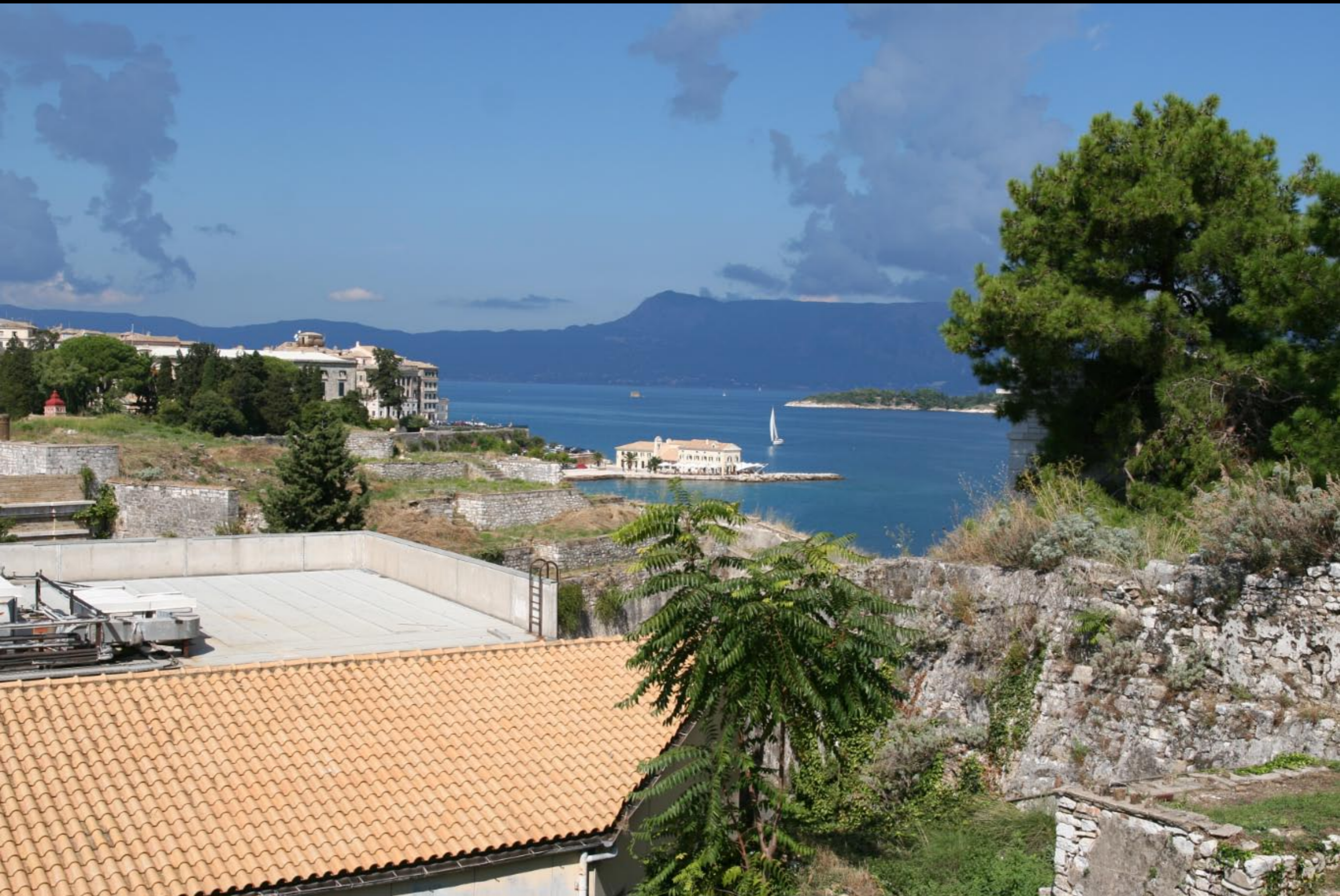
Views from the Fort - not Pontikonisi