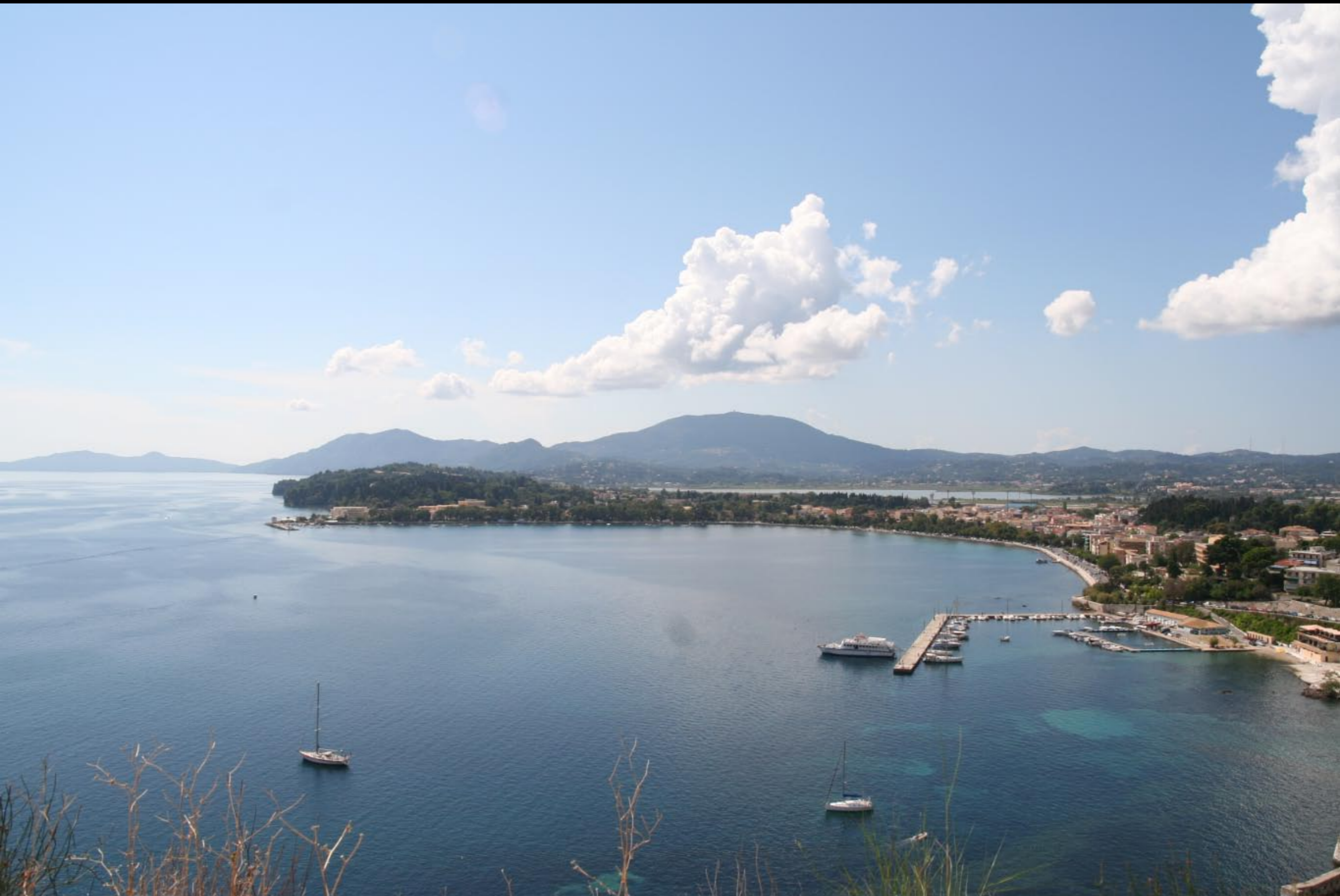
Views are all really good