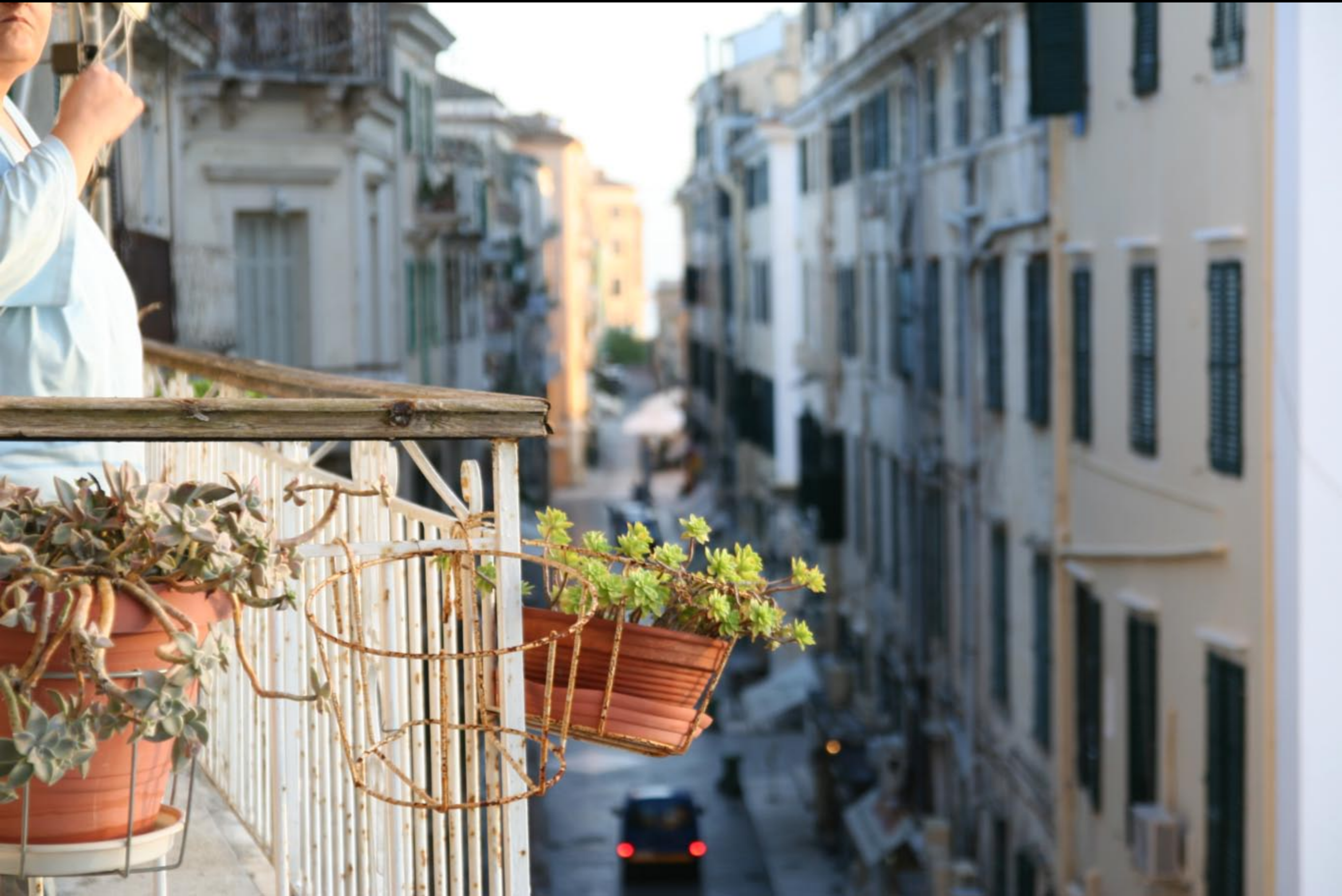
Neighbor - not happy to be photographed