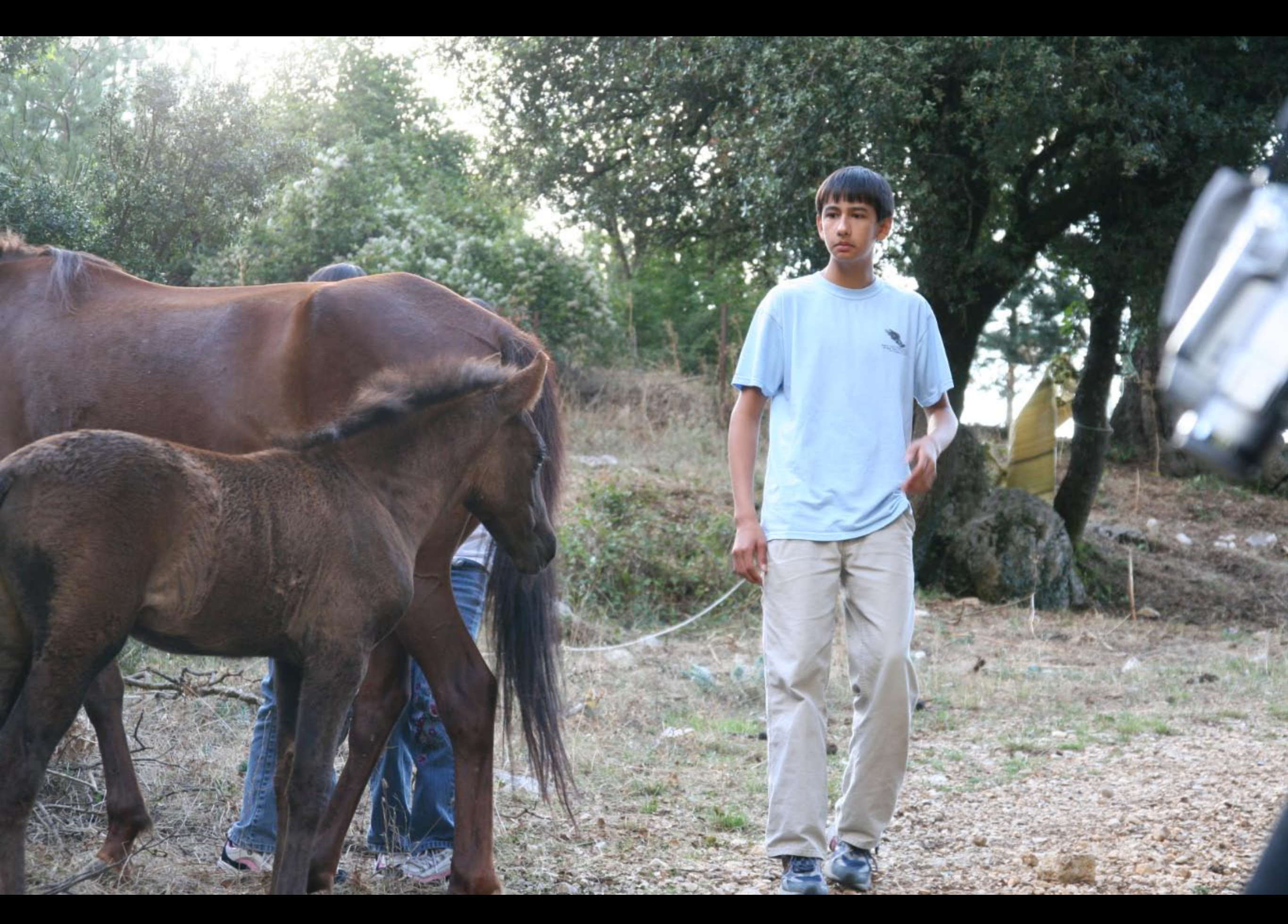
It just looks like he's holding a string