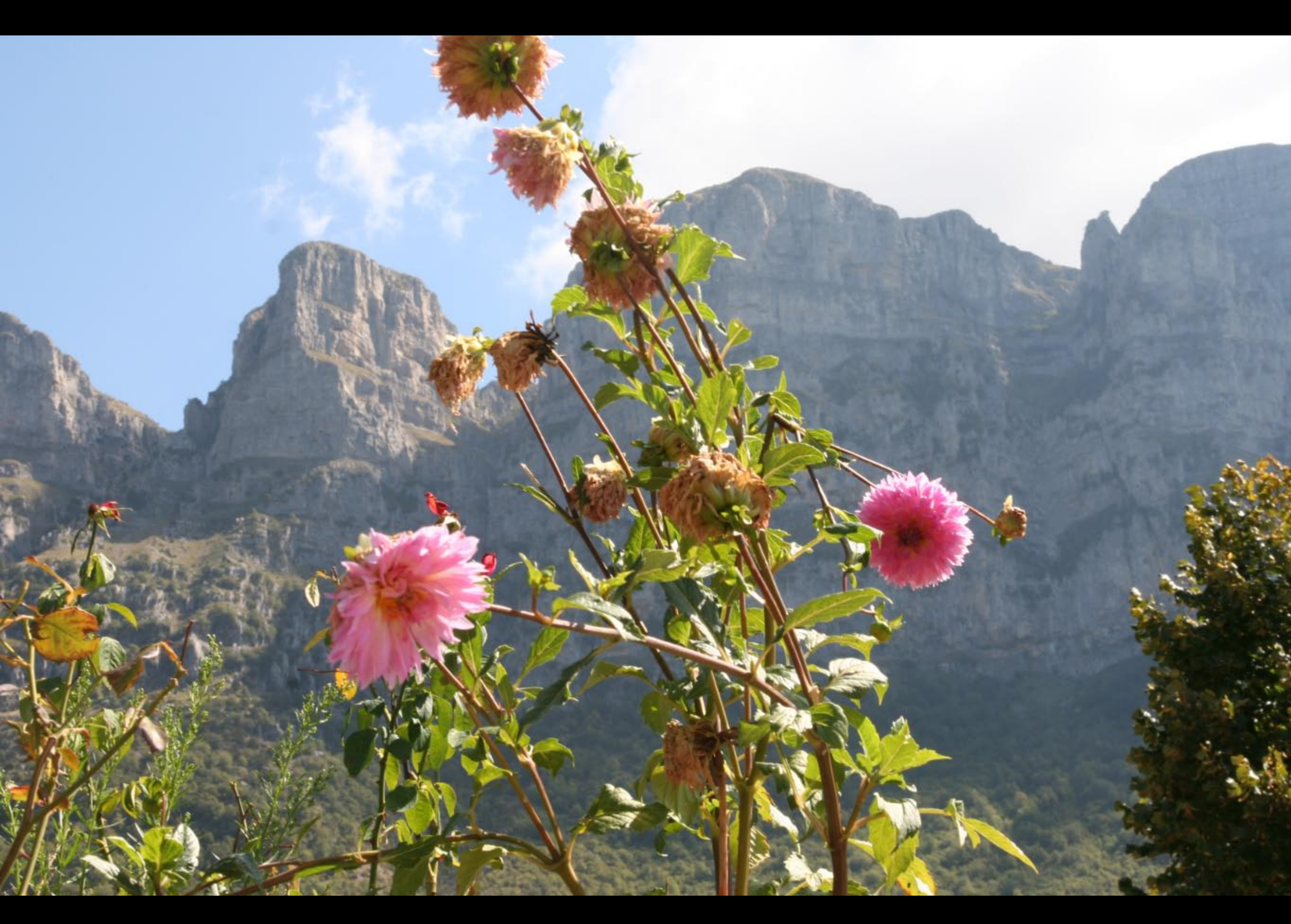
More flowers and stone mountains