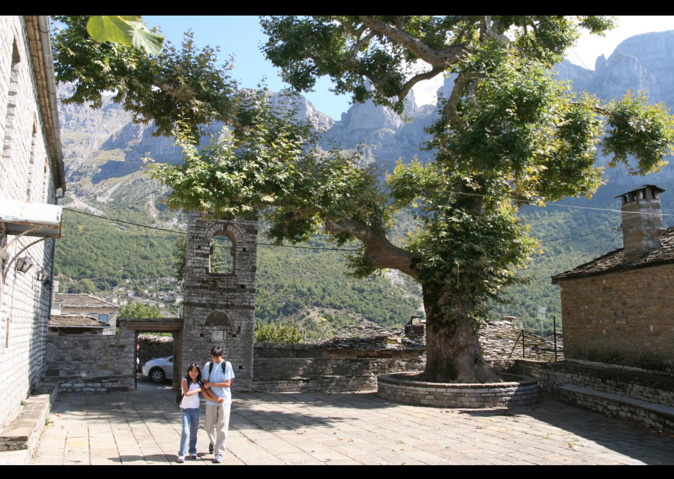
Helen, Theodore, church bell, tree and mountains