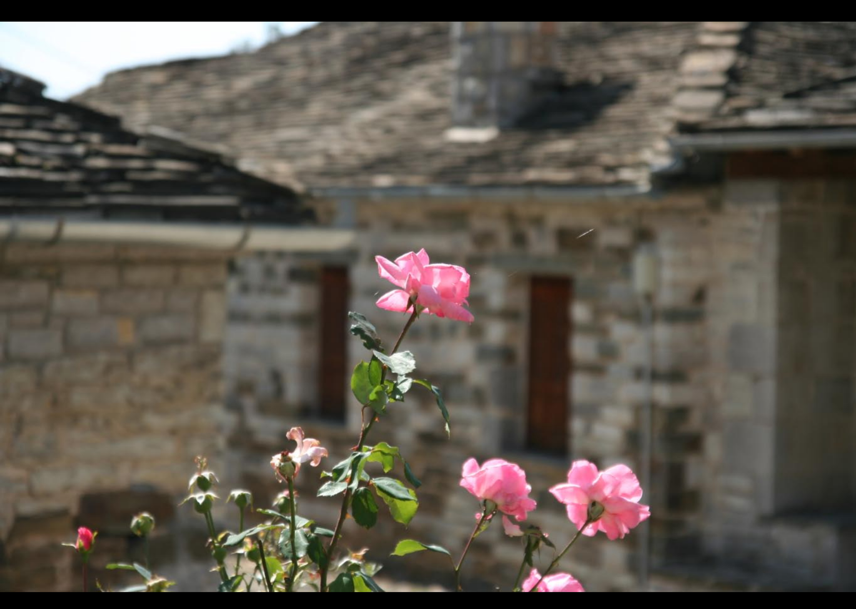
Village flowers and stone buildings