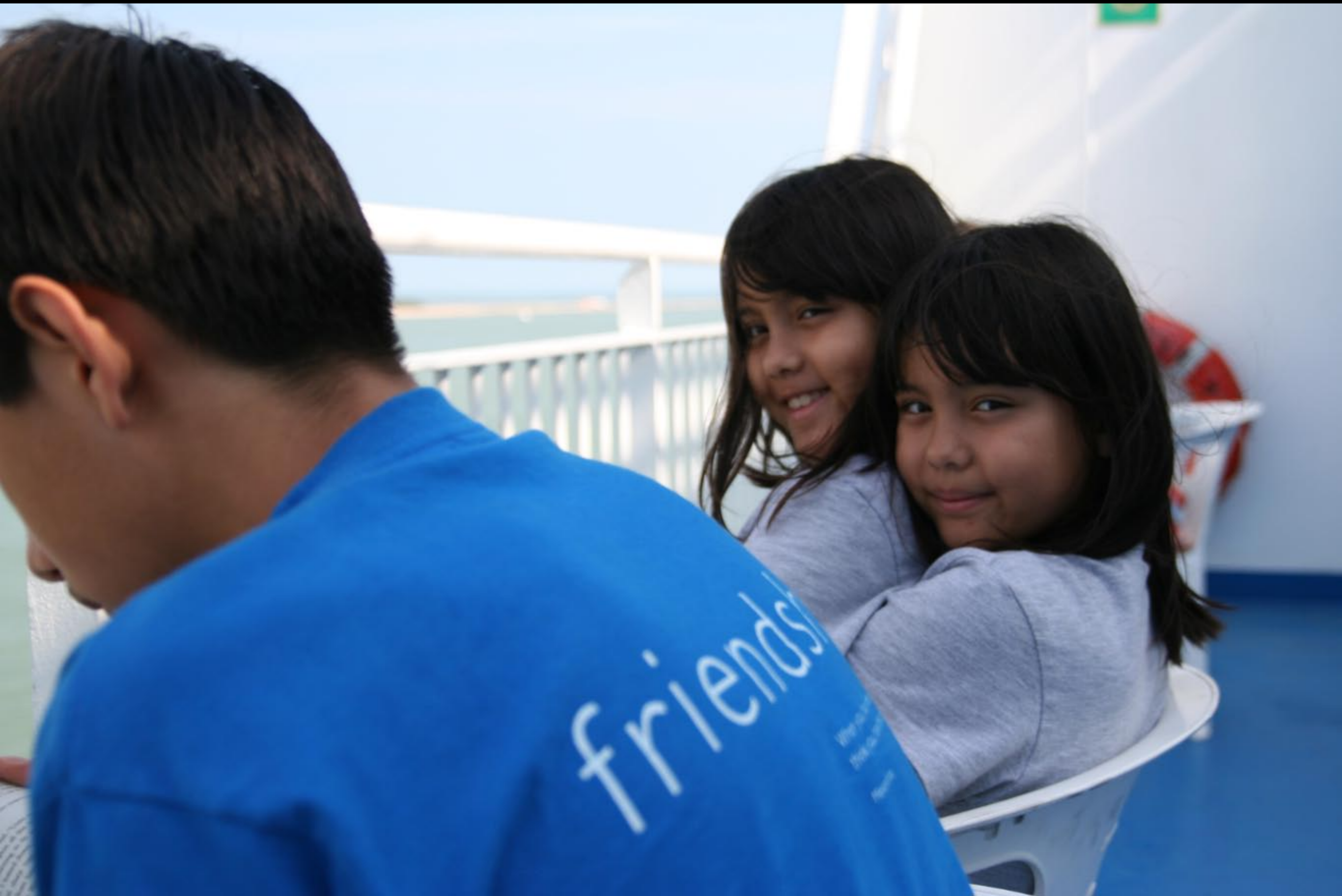
Awake and smiling - Mona Lisa smile