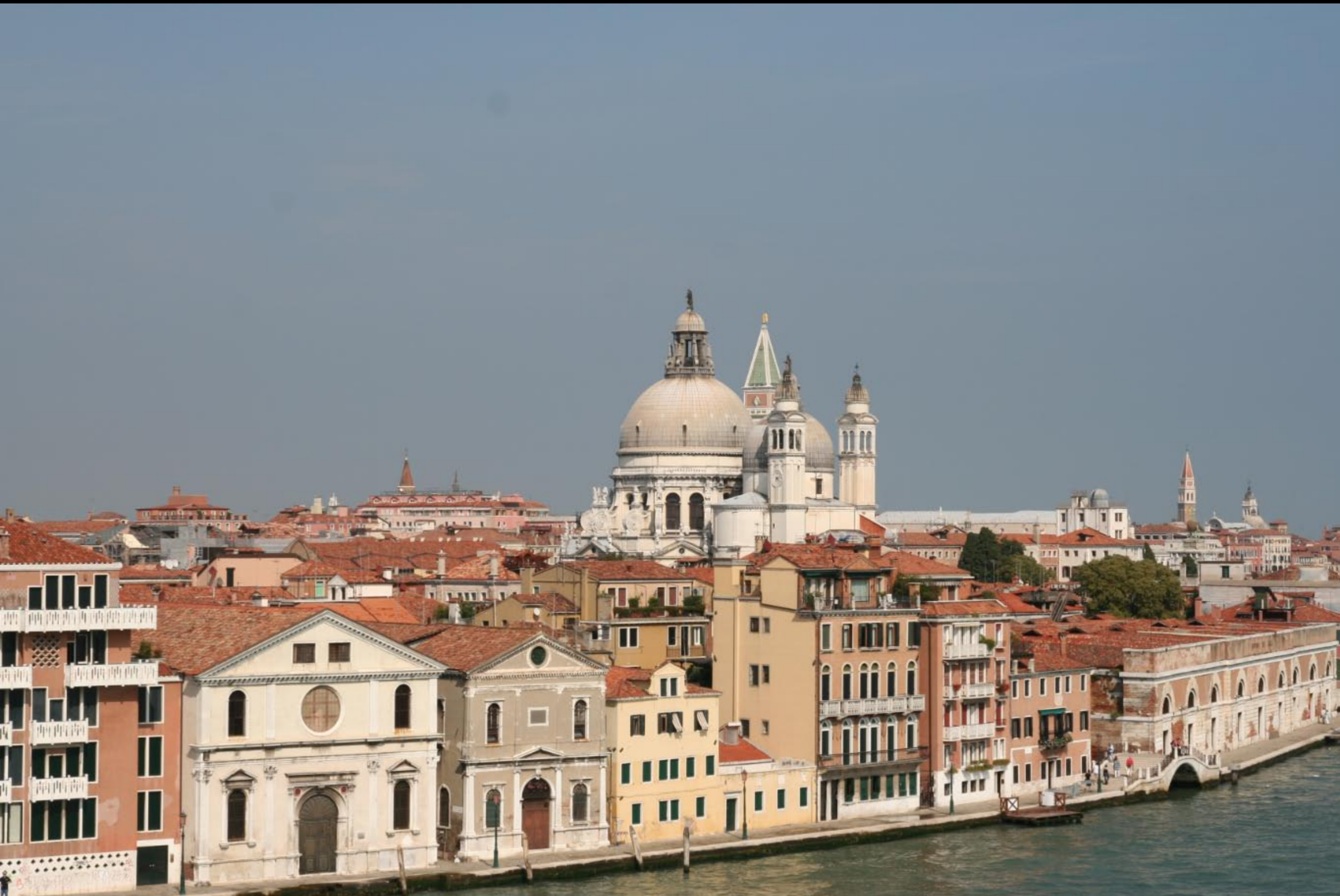
Church of Madonna Della Salute