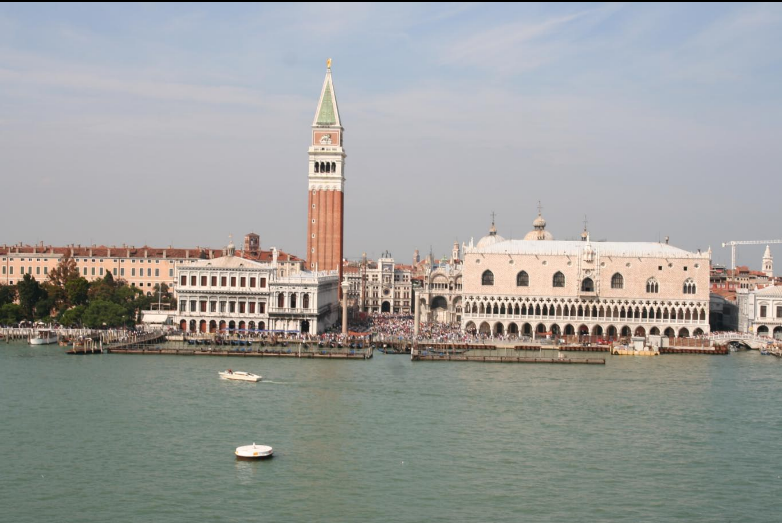
Piazza San Marco, Doge's Palace, etc.