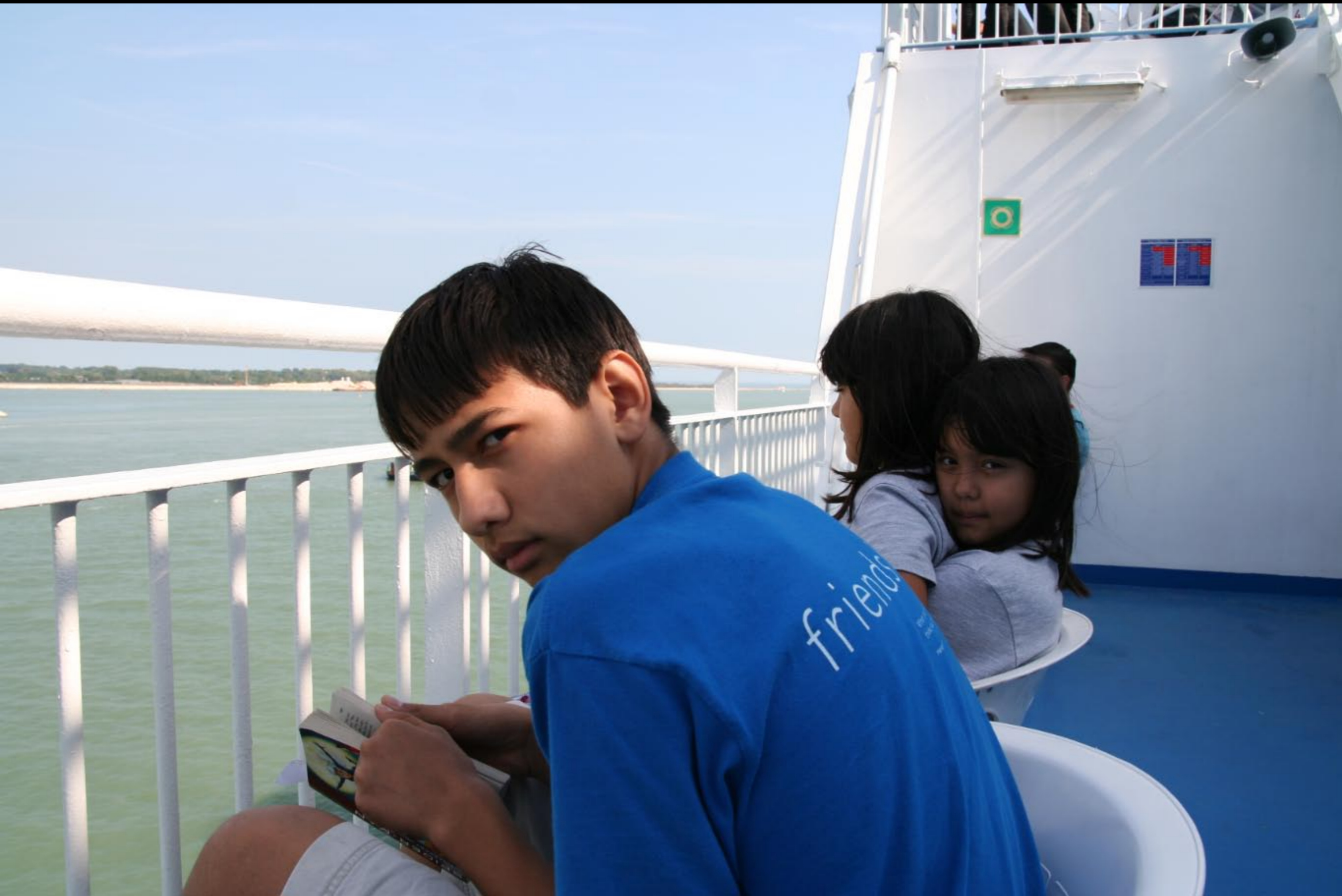
No. I'm not reading spiderman